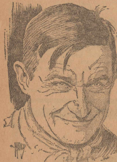
Another "Bull" Durham advertisement by Will Rogers, Zigzag Editor and general manager, and leading American humorist. More coming. Watch for them.

The BULL'S EYE is a publication that goes to print. When does it go to print? It goes to print when ever there is something to print.