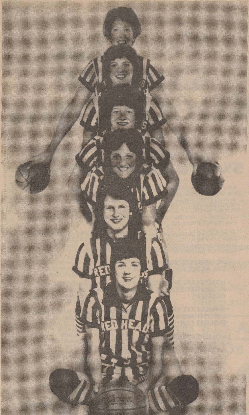
REDHEADS COMING: The Rotan Lions Club will be sponsoring The All American Red Heads, a woman's professional basketball team, to play against a Rotan men's team. The event is scheduled to take place on Friday, March 5, at 7:30 p.m. at the Rotan High School Gym. Advance tickets are $3.00 for adults and $2.50 for students and can be secured from any Rotan Lions Club member.

work during the semester and have earned a grade point average of at least 3.5 on a 4.0 scale are eligible for the Dean's List. The Merit List is composed of students enrolled for more than eight semester hours but fewer than 12 hours and who made a grade point average of at least 3.5.