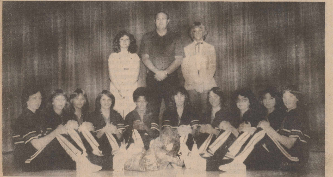
WIN DISTRICT CROWN: The members of the Roby Girls Varsity Basketball Team defeated Jayton last Friday night to capture the District Crown. The girls went through District play and compiled an 8-0 record. They will play Roscoe next Tuesday night in Sweetwater for the Bi-District Championship.

The Bi-District game between Roscoe and Roby will be in the Sweetwater High School gym beginning at 7:00 p.m. on Tuesday, February 23rd.