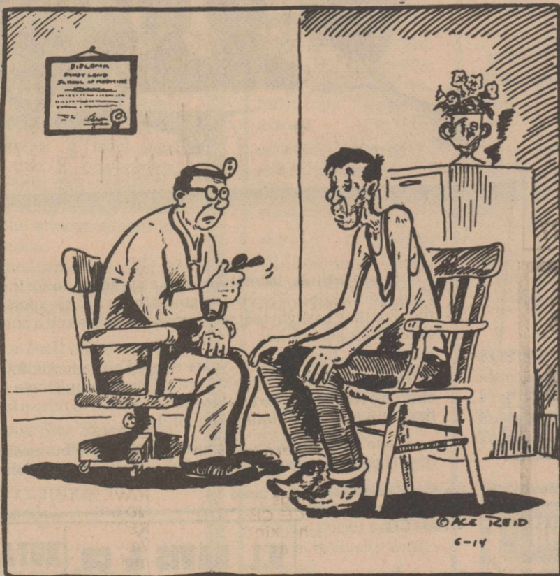
"Better sell that ranch or give up that late television movie. The two of them are killin' you."

It's Easy To Make A Quick Recovery From Financial Ills With A Loan From First National Bank Of Rotan. Our Service Is Prompt And Friendly And All Transactions Are Strictly Confidential! We're Here To Help You Help Yourself!!!