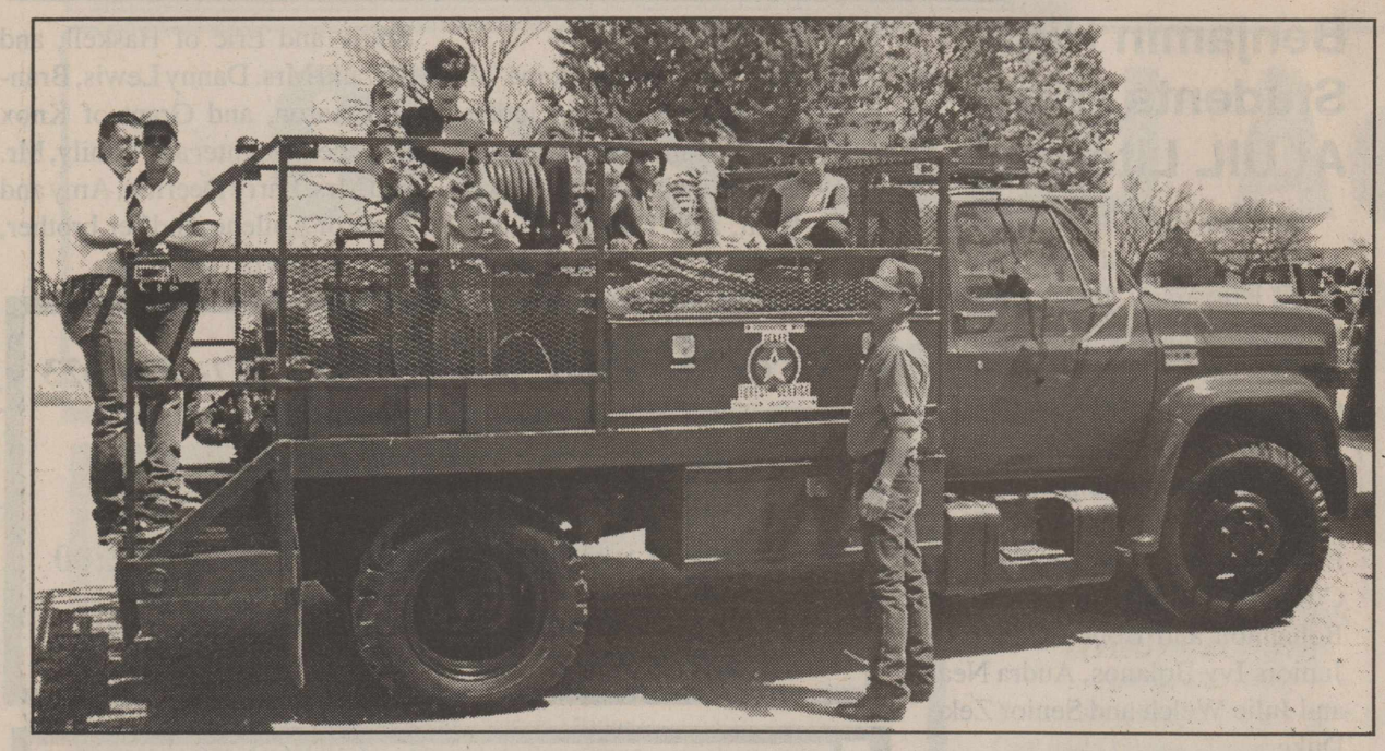
READY FOR A RIDE TO THE BENJAMIN CITY PARK to hunt Easter eggs, these Benjamin children were treated to rides on the fire trucks of the Benjamin Volunteer Fire Department. A host of volunteer firemen and parents turned out to make sure all the kids had a good time. Upon arrival at Benjamin's City Park, all the kids participated in an Easter egg hunt. (NEWS Photo)

PAGE 6, Thursday, April 11, 1996, THE KNOX COUNTY NEWS