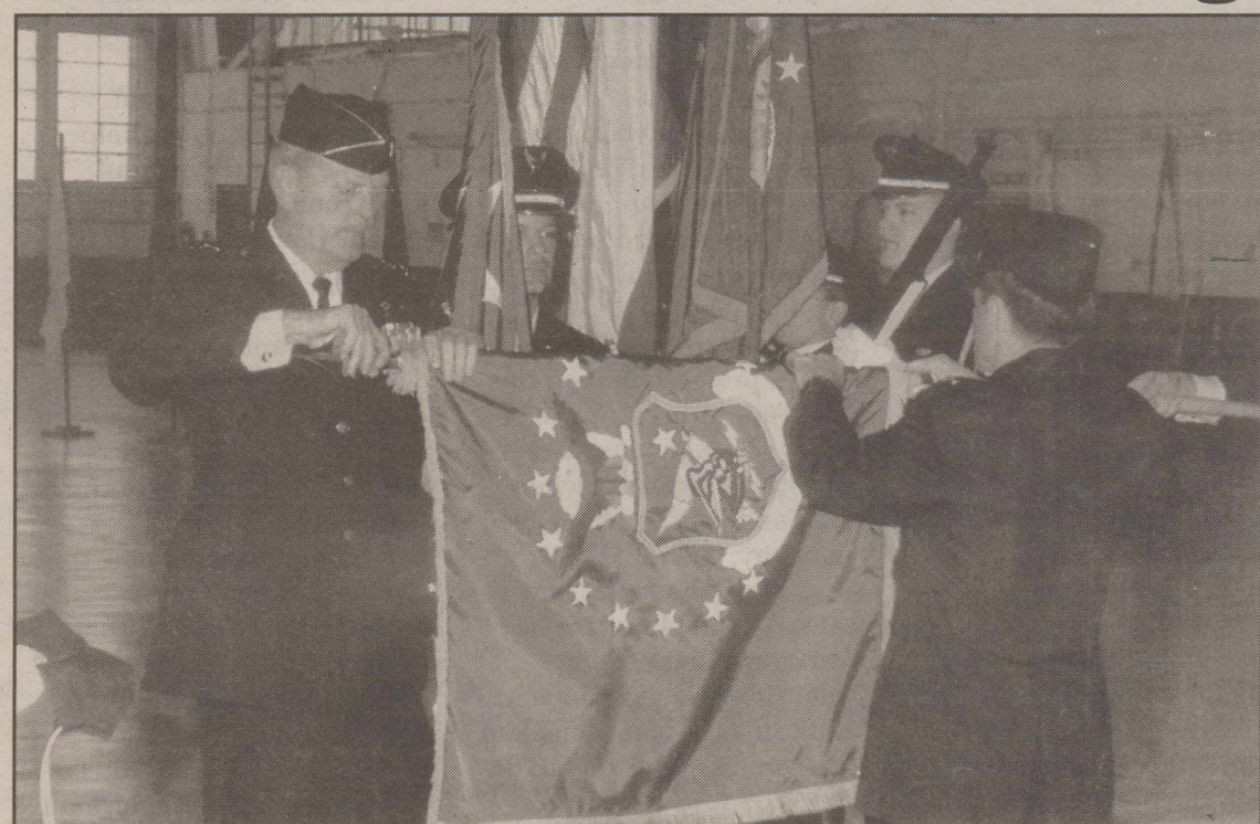
Lt. Gen. Clark Griffith, Air Education and Training Command vice commander, left, and Col. Kodak Horton, 64th Flying Training Wing commander, roll up the 64th FTW flag prior to it being sheathed during the wing's ceremonial inactivation April 2. See more photos on pages 4 and 5.

Lt. Gen. Clark Griffith, Air Education and Training Command vice commander, (Continued on page 4)