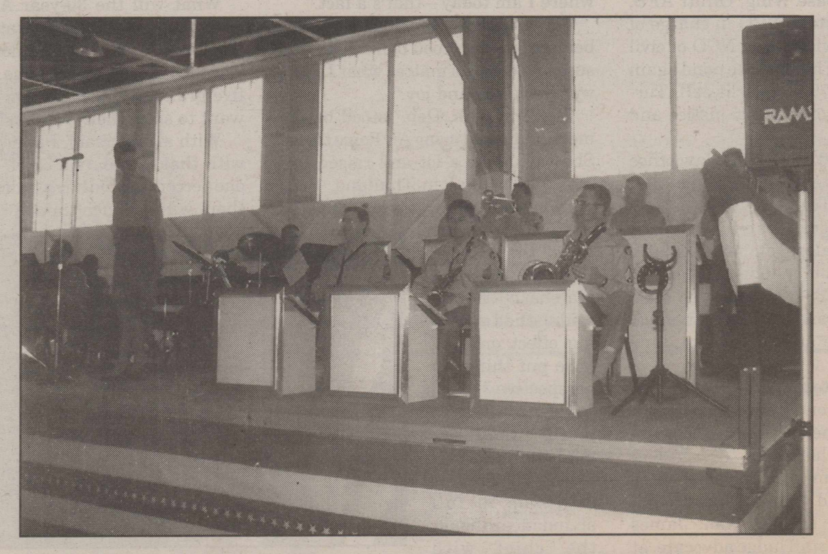
The Air Education and Training Command 'Band of the West' "NightHawk" Jazz Ensemble played music during the barbeque picnic April 1 in Hangar 70.