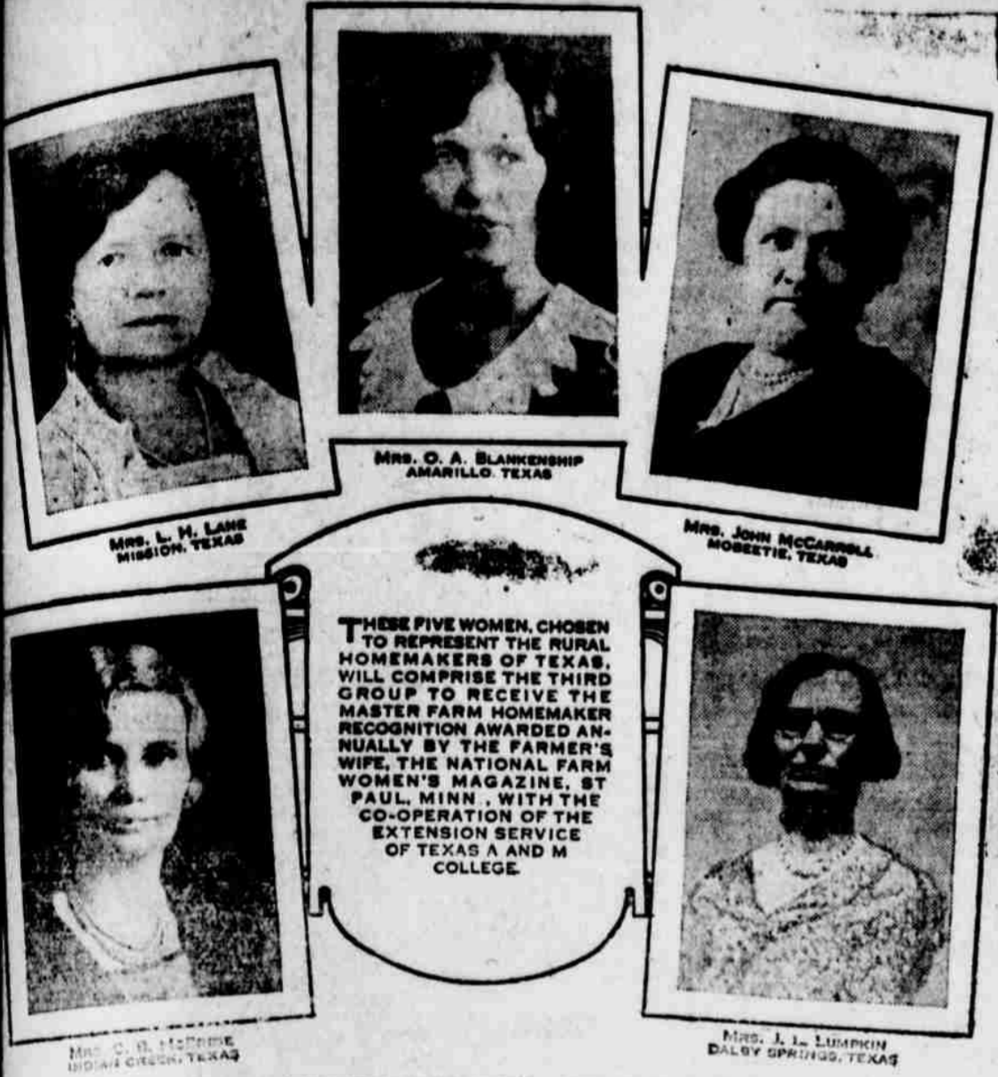
THESE FIVE WOMEN, CHOSEN TO REPRESENT THE RURAL HOMEMAKERS OF TEXAS, WILL COMPRISE THE THIRD GROUP TO RECEIVE THE MASTER FARM HOMEMAKER RECOGNITION AWARDED ANNUALLY BY THE FARMER'S WIFE, THE NATIONAL FARM WOMEN'S MAGAZINE, ST. PAUL, MINN., WITH THE CO-OPERATION OF THE EXTENSION SERVICE OF TEXAS A AND M COLLEGE.