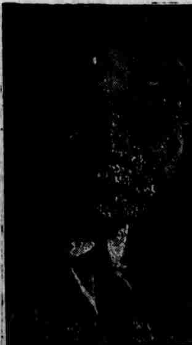
R. S. STERLING Houston Candidate for Governor

Explanatory Note.—The estimated reduction in the tax rate has been calculated in accordance with the best available information. The exact figure will depend upon varying conditions in each county. But that a material reduction of the ad valorem taxes would be affected under the plan is certain.