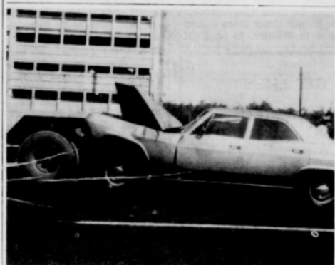
This 1965 Chevrolet Sedan received heavy damage Monday, 2 miles west of Baird. The driver of the auto was not injured, due to the fact he was wearing a safety requirement installed in this auto - Safety Belts. The Texas Safety Association are urging all drivers to install seat belts, and use them.