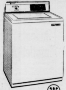
Model LAH400 HEAVY DUTY AGITATOR WASHER

THIS MATCHING SET HAS PROVEN VERY POPULAR.