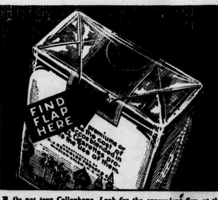
Do not tear Cellophane. Look for the convenient flap at the top and back of package