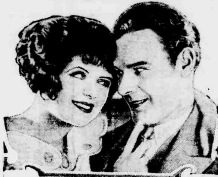
CLARA BOW—LANE CHANDLER IN "RED HAIR" BY ELINOR GLYN A CLARENCE BADGER PRODUCTION A PARAMOUNT PICTURE