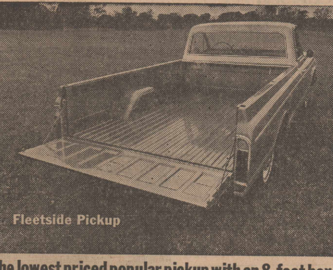
The lowest priced popular pickup with an 8-foot box.