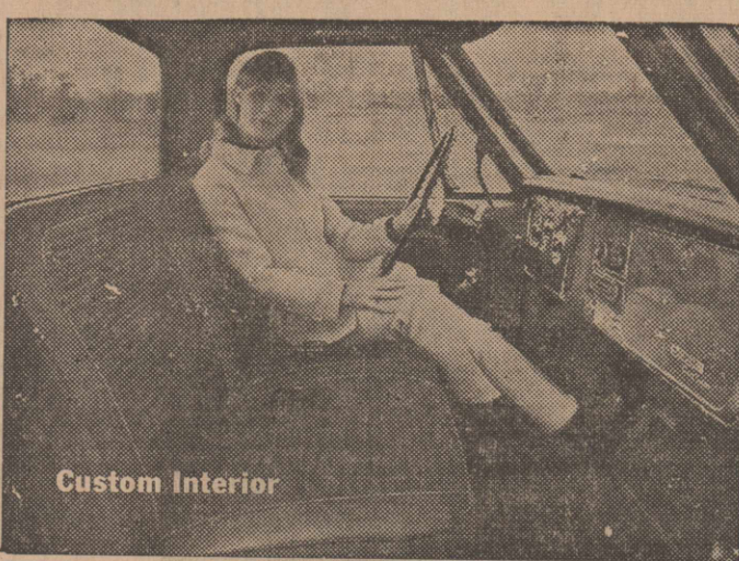
An inside as soft as the outside is tough.