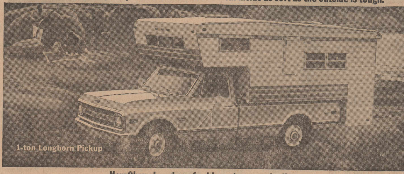
New Chevy Longhorn for biggest camper bodies.

Only a Chevrolet pickup can tally this list of advantages that add up to more value for your investment: Start with style-bold and hand some, newest in the field. Add smoothest pickup ride, the result of tough coil springs at all four wheels on most models. Plus the biggest choice of truck 6 and V8 engines in