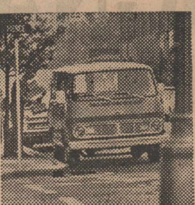
Low-cost Chevy-Van delivers loads of economy with big Sixes or work-whipping V8. Nimble maneuverability in traffic makes light of big loads. Now available with 3-speed Turbo Hydra-Matic.