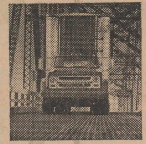
New workpower! A spirited new 350-cu.-in. V8 is standard in medium-duty V8 models. Order it for pickups, too! And there's big V8 power in heavy-weights. Chevrolet gives