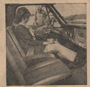
MORE COMFORT New, more comfortable seats are designed with molded foam. Thick insulation hushes road noise Bump leveling coil springs at all four wheels on most models smooth the way.