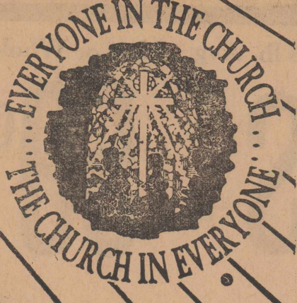
Coleman Adv. Serv.