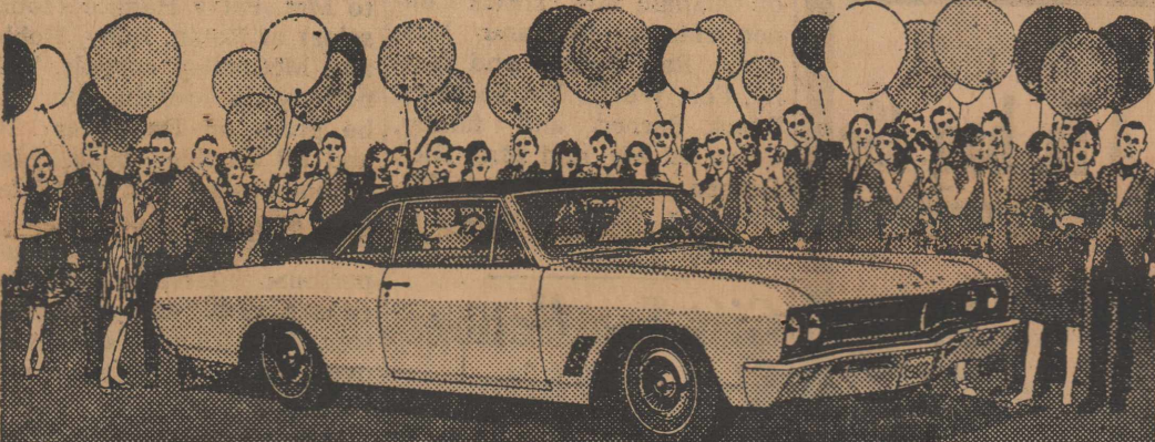
New Special GS. Low-priced. Nice?