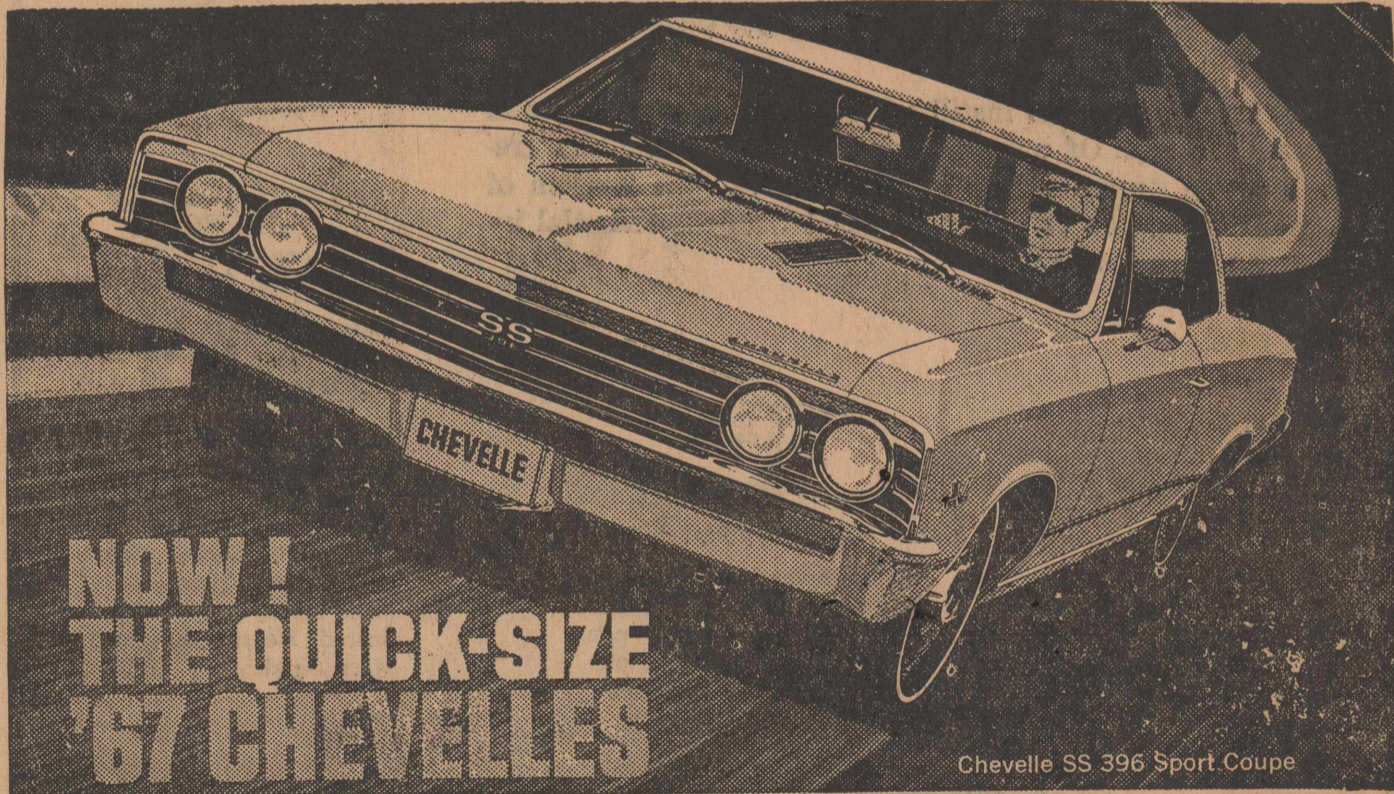
Chevelle SS 396 Sport Coupe

Family Style Buffet $1.00 Six Veg. & Fruit Salads Eight Vegetables Three Meats Cobbler-Ice Cream-Coffee-Tea FAMILY STYLE MEALS DAILY ROTAN HOTEL