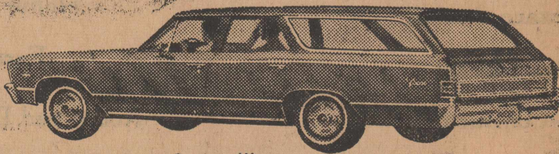
Chevelle Concours Custom Wagon

For '67, everything new that could happen... happened! Now, at your Chevrolet dealer's