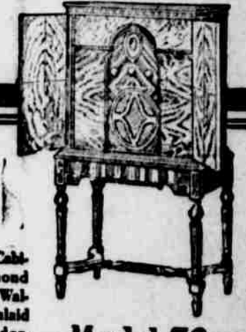
Low XVI Walnut Cabinet. Doors Diamond Matched Oriental Walnut with genuine Inlaid Marquetry Border.

Nothing Finer can be said of a Radio than "It's a NEW Majestic" ELECTRIC RADIO