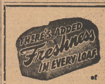
MIDLAND MAID BREAD