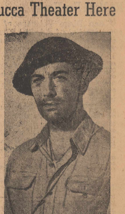
film epic, brings to the screen one of the greatest all-male, all-star casts in recent years. The action-packed story glorifies the last-man stand of a gallant patrol of this.

Purchasers of war bonds by Thursday afternoon will be given free tickets to see a bond premiere of "Bataan," starring Robert Taylor, Lloyd Nolan, George Murphy, Thomas Mitchell, Lee Bowman and many other top-flight actors.