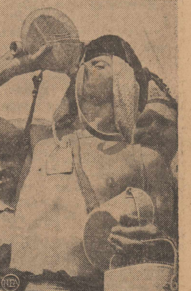
Thirsty Italian prisoner tilts the canteen high as he awaits transport to internment camp under the hot Sicilian sun.