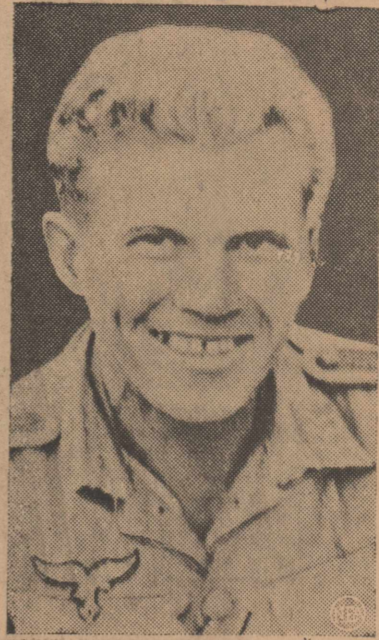
Smiling Nazi paratrooper seems quite undismayed by his capture by allies in Tunisia.