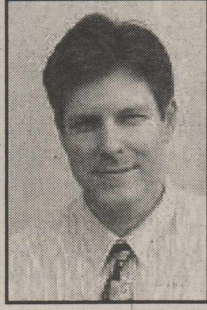
By Ed Sterling

those sets of maps, along with the agreed-upon state Senate district map, still must be submitted for preclearance in accordance with the U.S. Voting Rights Act. When or if that occurs, state party primaries could be set on a single date, and the path paved toward the picking of nominees who will face each other in the November general election.