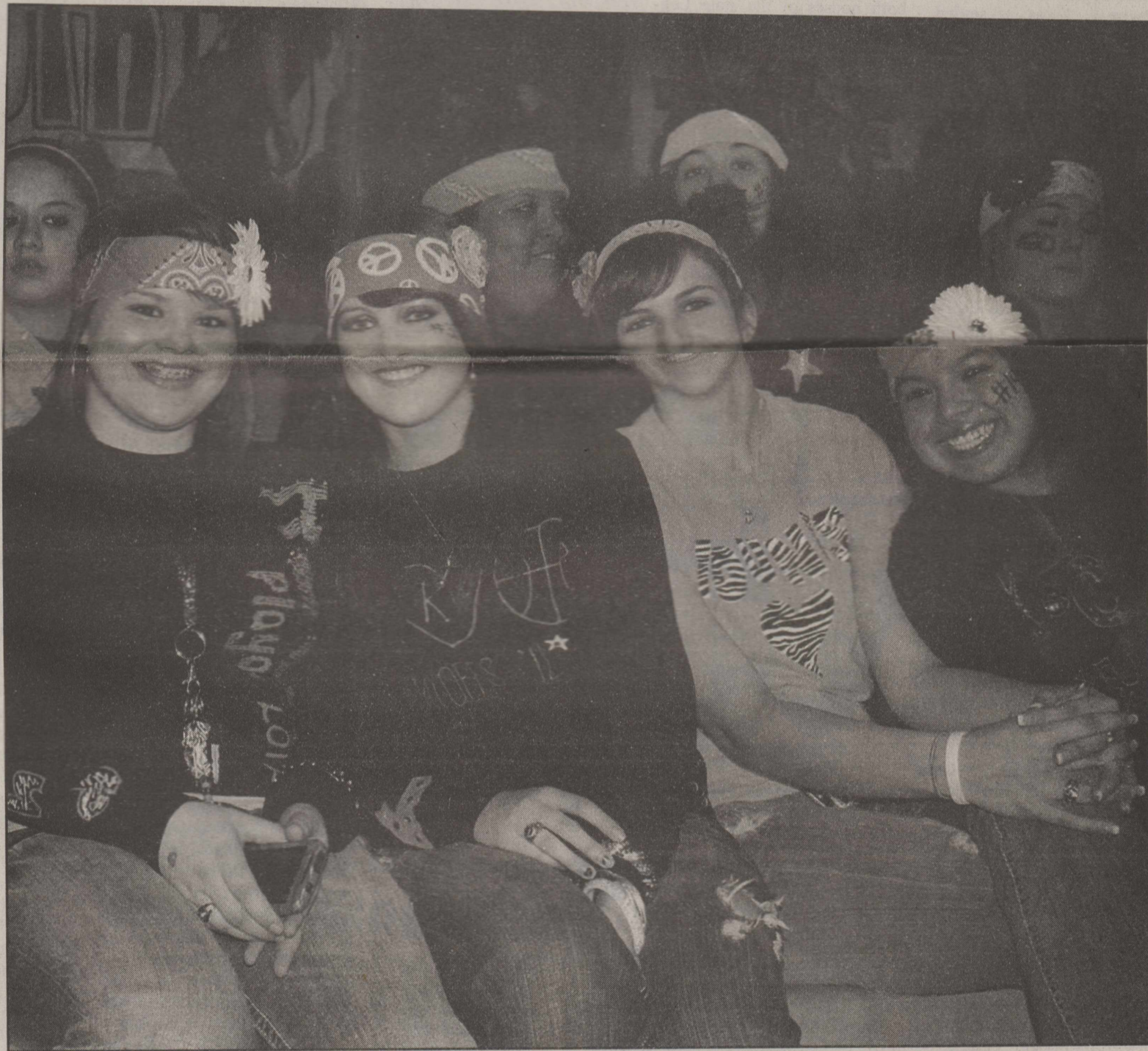
The Knox City High School fans showed off their basketball spirit - and their brightly-colored headbands - during the Greyhounds' playoff game against the Woodson Cowboys on Tuesday. The students were among a large contingent of KCHS fans making the trip to Seymour to cheer on the Greyhounds. For results of the Greyhounds' playoff game see Page 5.