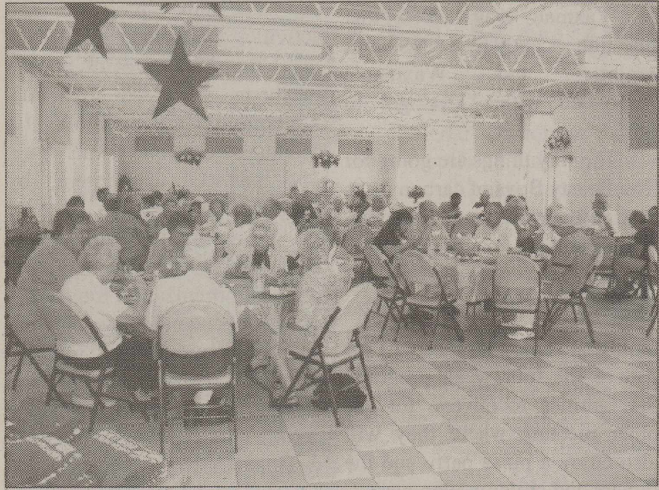
These 29 Extraordinary Cancer Survivors met at the First Baptist Church in Knox City to have lunch and kick off the Relay for Life Events that were held On April 25, 2009.