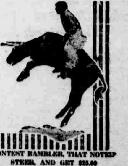
CONTEST RAMBLER, THAT NOTED STRER, AND GET $25.00