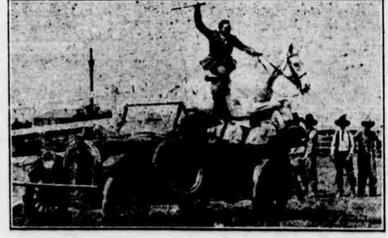
SEE TRIGGER—THAT FAMOUS HIGH JUMPING HORSE

PROGRAM FOR THE TWO BIG DAYS AND TWO NIGHTS WILL CONSIST OF THE FOLLOWING ATTRACTIONS: RODEO RACES, BIG CARNIVAL ATTRACTION, CONCESSIONS OF ALL KINDS