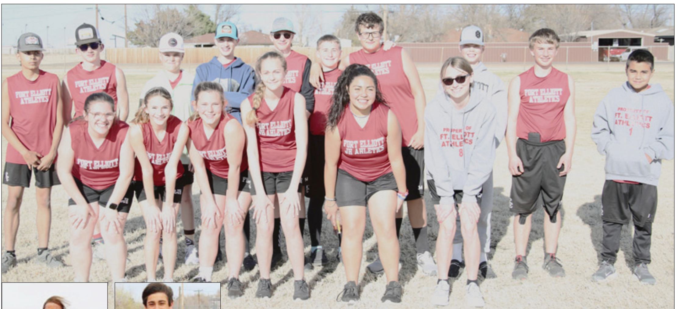
March 23 the Fort Elliott JH Track team competed in the White Deer track meet. Fort Elliott boys placed 2nd as a team.