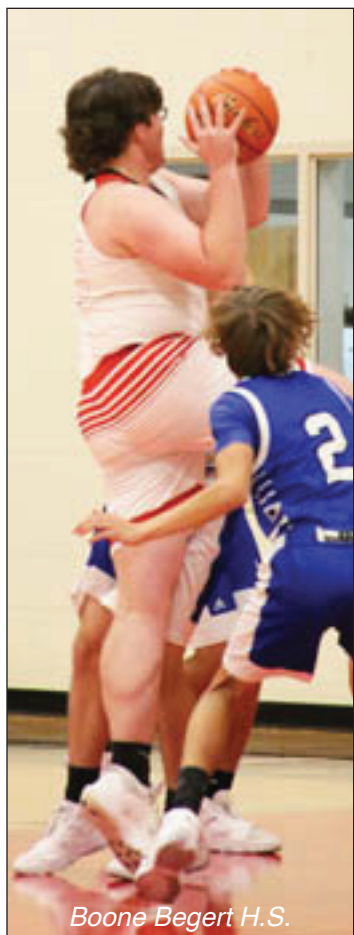
Boone Begert H.S.