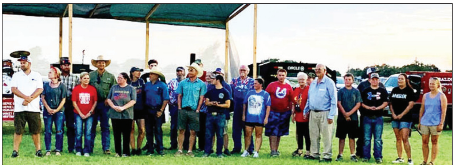
Volunteers of the Year — Tom Birtt Memorial Park Team of Volunteers