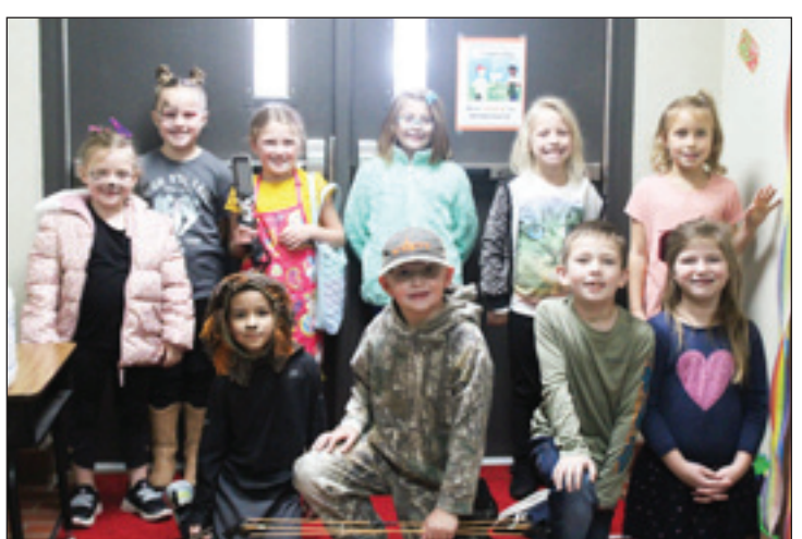
First Grade Class