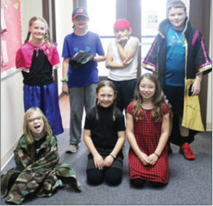
Fourth Grade Class