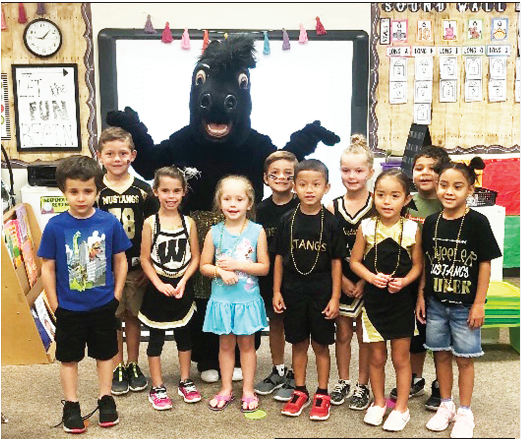
MIGHTY VISITS WHEELER KINDERGARTEN CLASSES