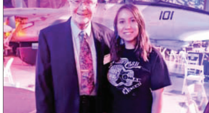
Stormie Meriwether is shown here with Fred Haise, Lunar Module Pilot, Apollo 13. Stormie and her parents, Leroy and Rhonda, were in attendance at the 2021 Aviator Ball, Tulsa Air and Space Museum, 50th Anniversary Celebration of Apollo 13 and 14.

QUALIFIED A/E. FURTHER, BY SUBMITTING A RESPONSE, THE A/E FULLY, VOLUNTARILY AND UNDERSTANDINGLY WAIVES AND RELEASES ANY AND ALL CLAIMS AGAINST THE DISTRICT AND ANY OF ITS TRUSTEES, OFFICERS, AGENTS AND/OR EMPLOYEES THAT COULD ARISE OUT OF THE EVALUATION, RECOMMENDATION OR SELECTION OF AN A/E IN RESPONSE TO THIS RFQ.