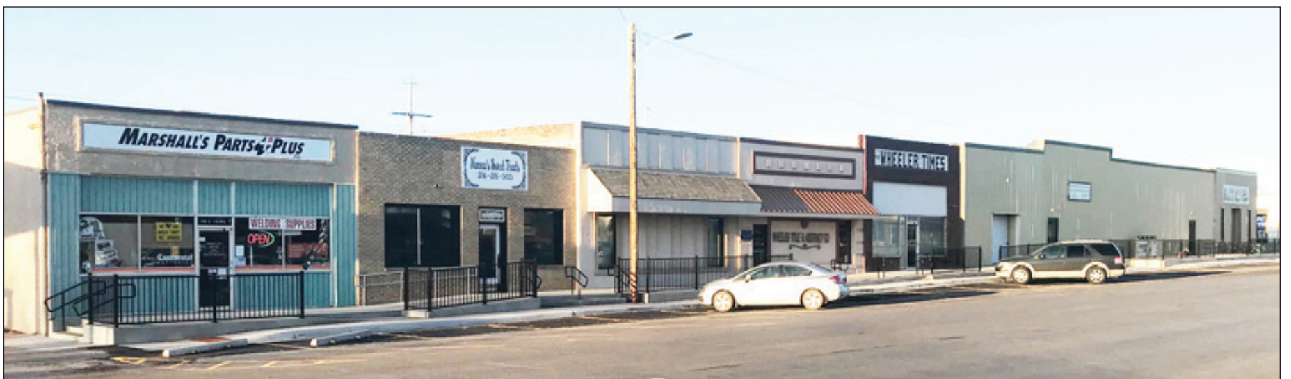
EAST TEXAS STREET: The Texas Street Project is now complete with parking stripes. This picture was taken early Monday, March 29, 2021. It looks very nice and is quite a colorful block. West Texas still has some tape up; we will get a picture of that block at a later date.