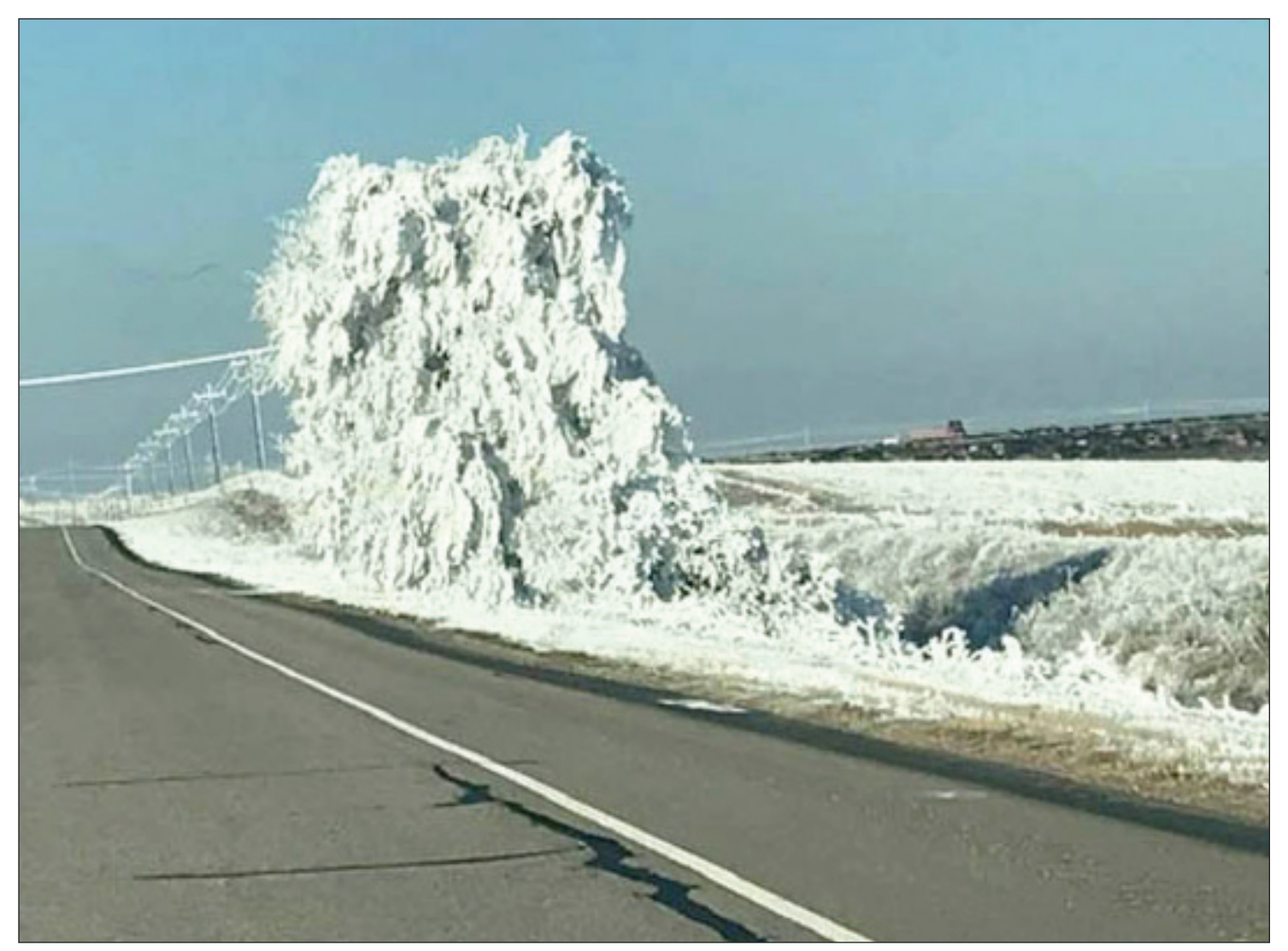
Joyce Walker took this picture of a snow pile on the road to Pampa.