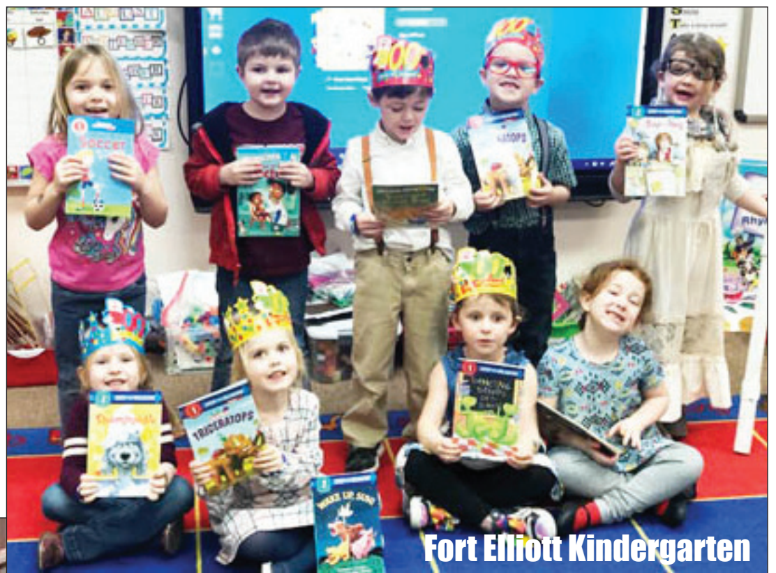
Fort Elliott Kindergarten