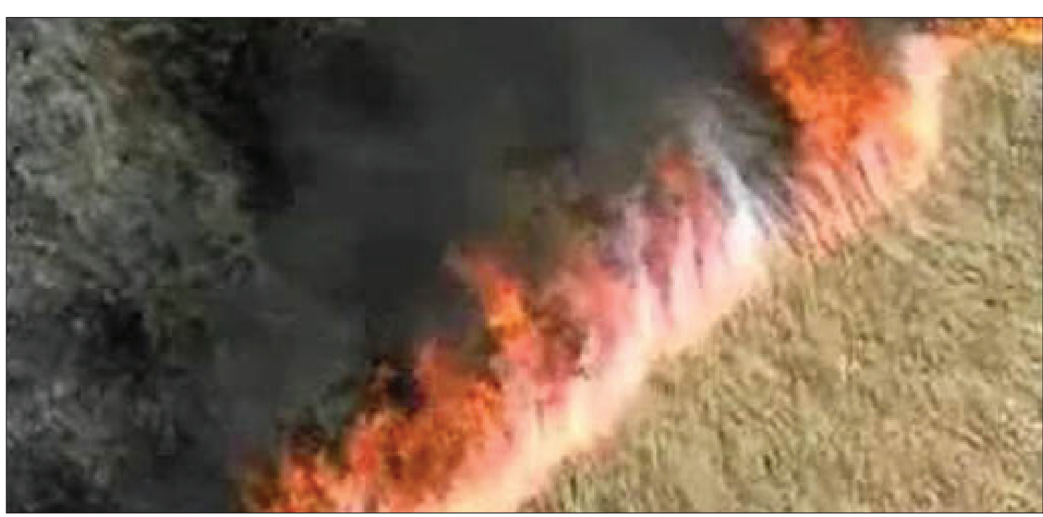
things - papers, items, to-do drawing a blank right now as HIGHWAY 152 CLOSED: Highway 152 between Wheeler and Pampa was closed Saturday afternoon, February 6, 2021 for a period of time due to grass fires. Six or more fires were set along the highway between Wheeler County line and Laketon by a tire coming off a truck traveling the road. Wheeler County Fire Departments were called around 1:30. The blaze was brought

(Continued Page 2) under control around 4:30.