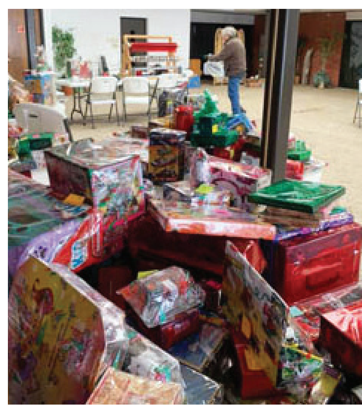
Wheeler County 2020 Toys For Tots was a success.

THE WHEELER TIMES Page 4 — Thursday, December 24, 2020