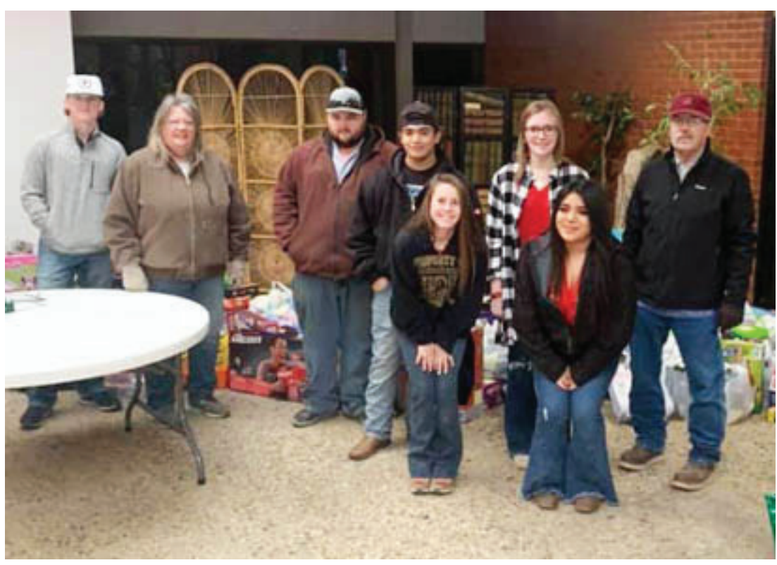
The Fort Elliott FFA donated and helped with the wrapping of the Toys for Tots.