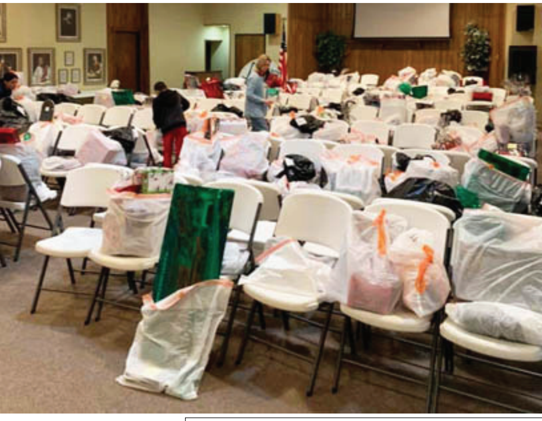
Ready for Delivery