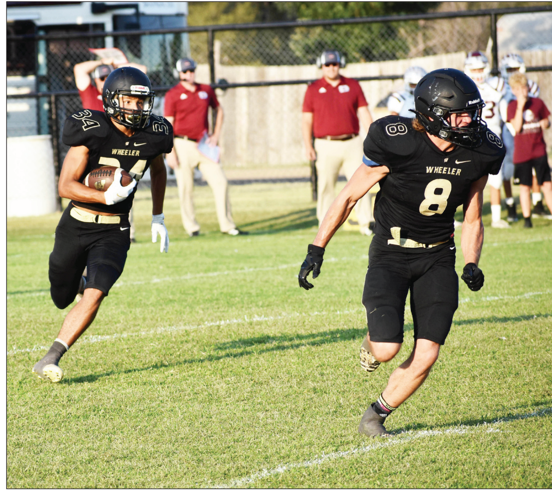
The ball moves downfield.