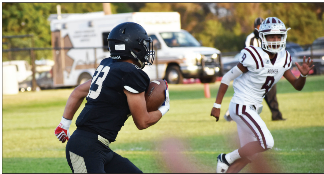
Moving down the field.