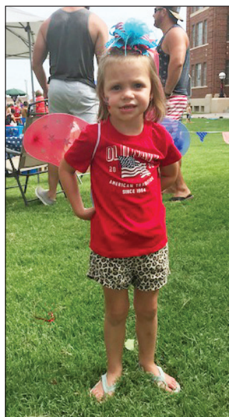
4th of July Fairy