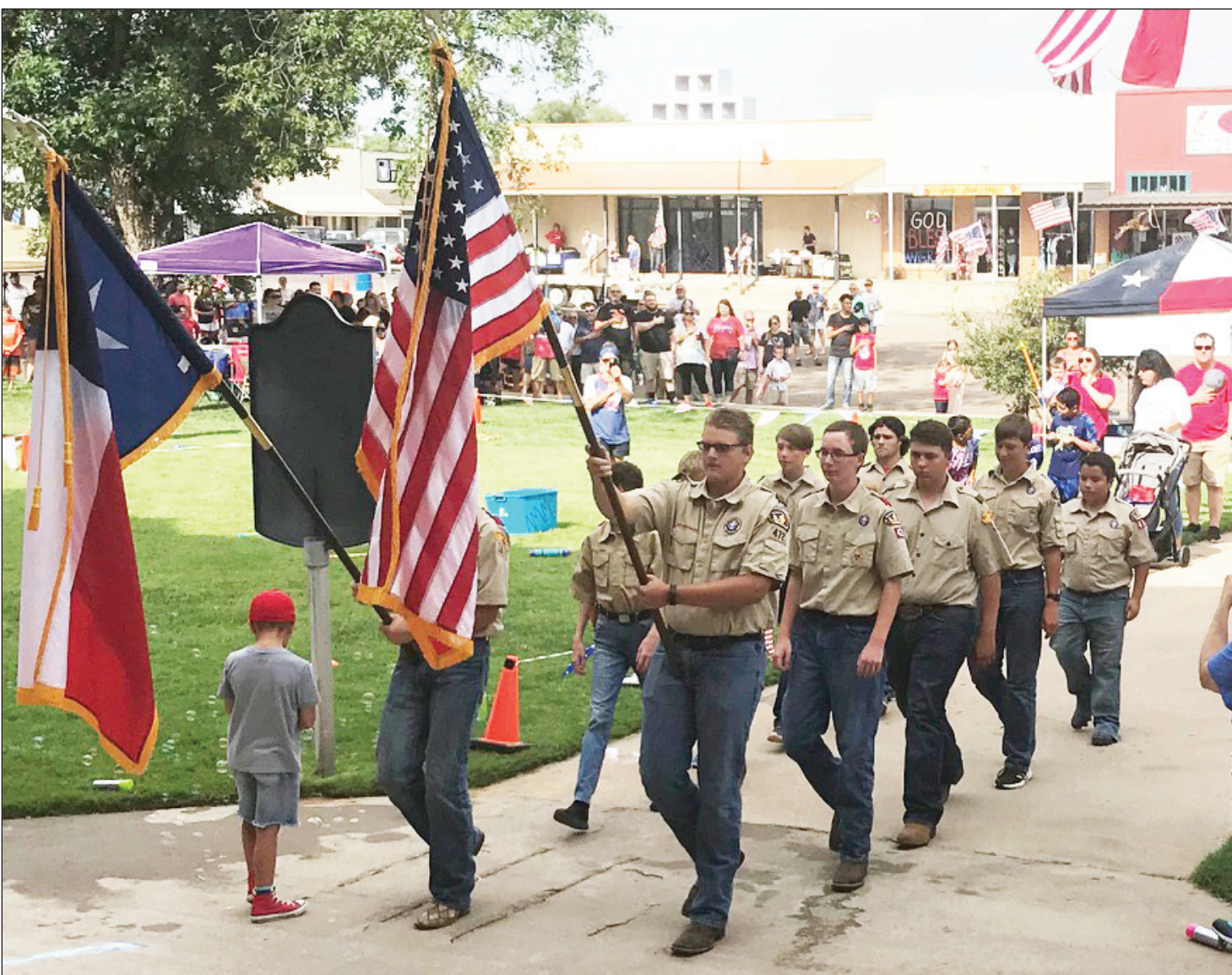
Flag Ceremony by Wheeler Boy Scout Troop opening Ceremony for Wheeler's 35th 4th of July Celebration.