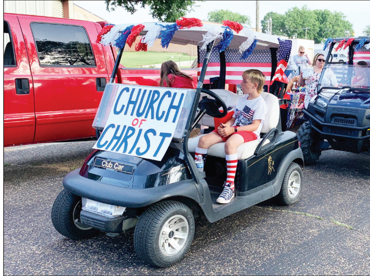
Church of Christ