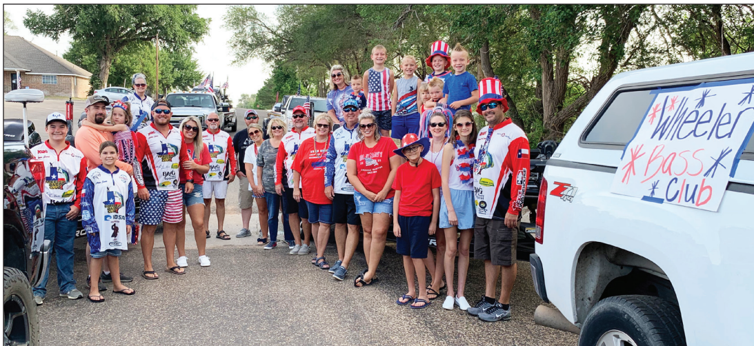
Wheeler Bass Club