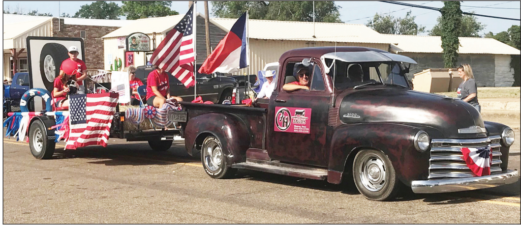
H & H Tire & 7-H Angus Float in Parade