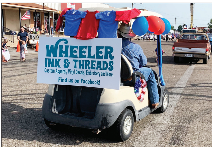
Wheeler Ink & Thread