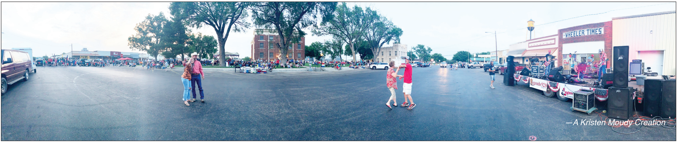
—A Kristen Moudy Creation