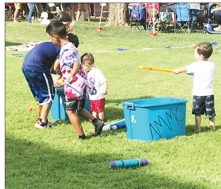
Children at play.