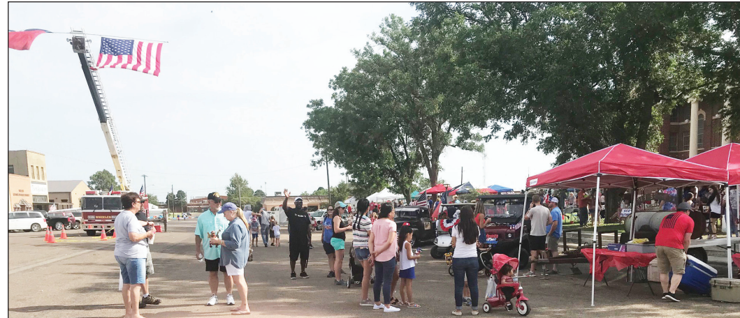
West side of the Square