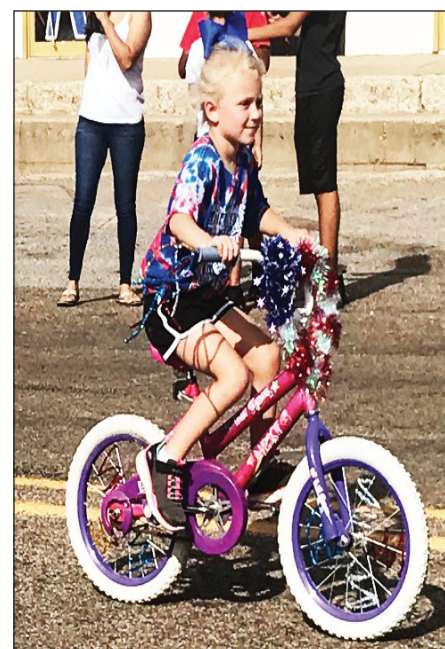
In the Parade