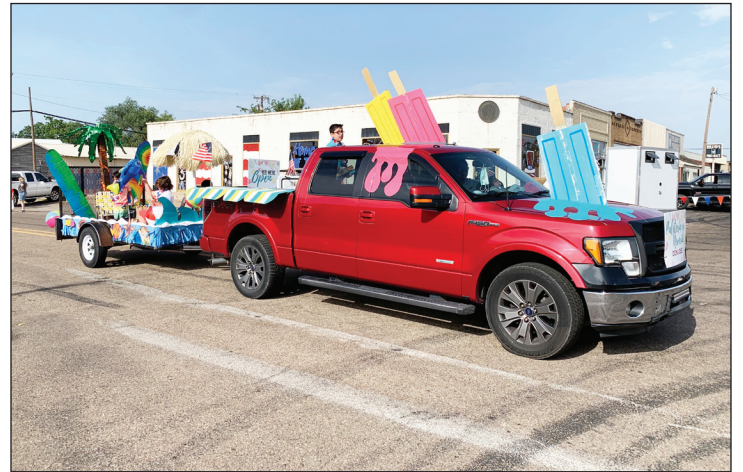
Paletaria y Neferia don jose