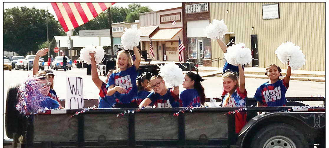
Wheeler High School Cheerleaders