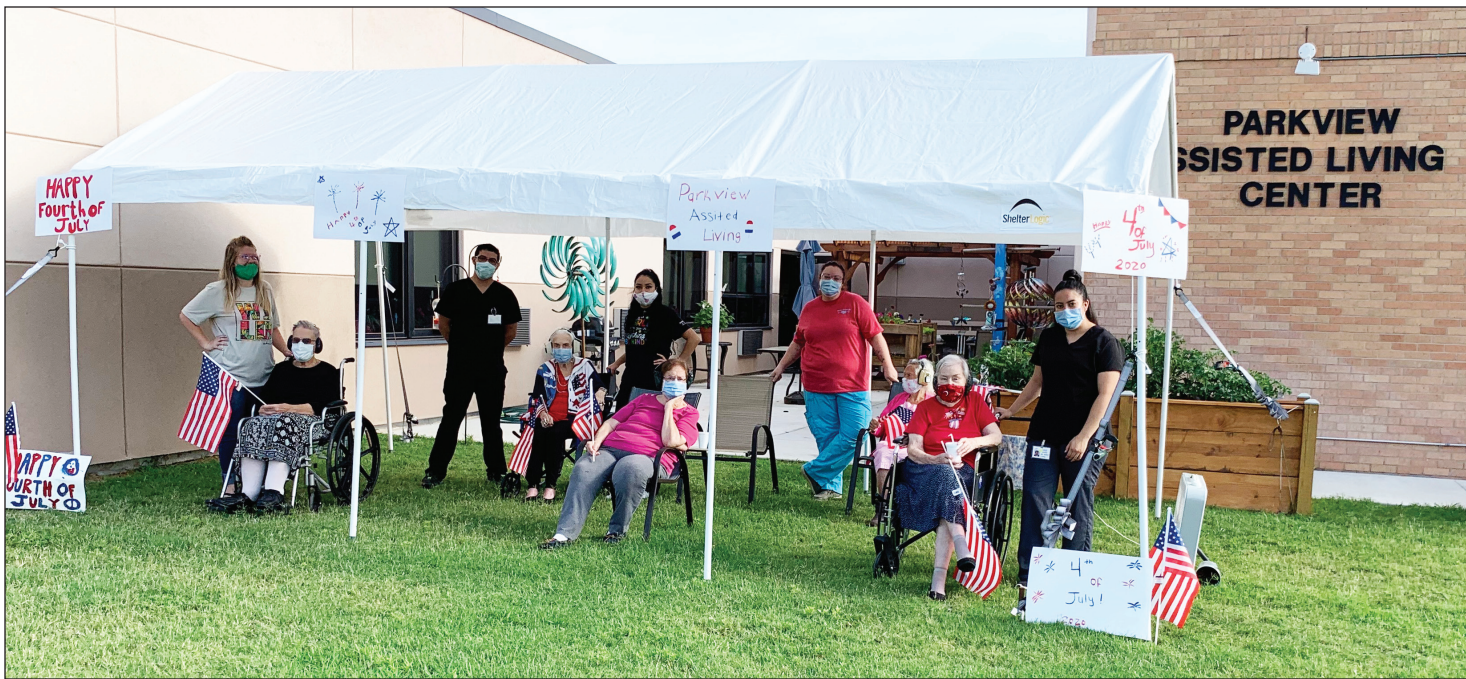
Parkview Hospital Assisted Living Residents