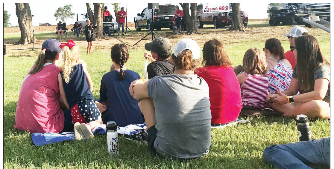
Enjoying Activities at Britt Field July 4, 2020