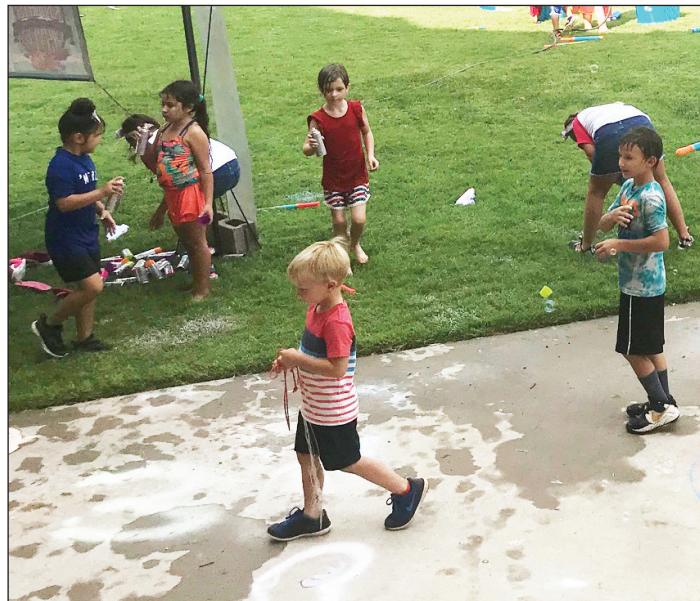
Children at play.