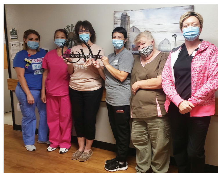
Wheeler Nursing & Rehab, Business of the Year