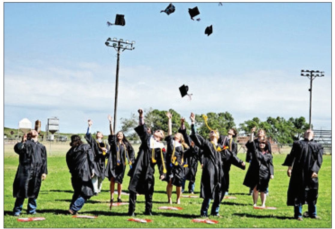
Fort Elliott Seniors give their caps a toss after graduation.

tered, prominently located on my desk, for my admiration, a simple pleasure that contains more significance than I thought when I purchased it a few hours ago. Like many things, and many people, their significance and value are only properly appreciated in hindsight.