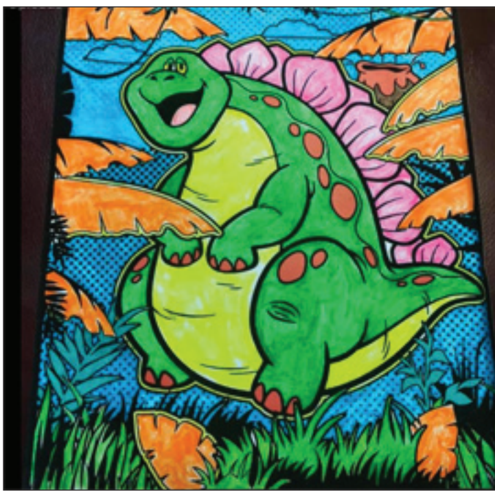
Wheeler Care Center