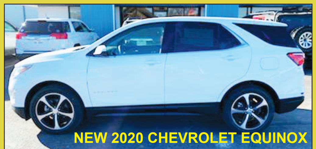
NEW 2020 CHEVROLET EQUINOX