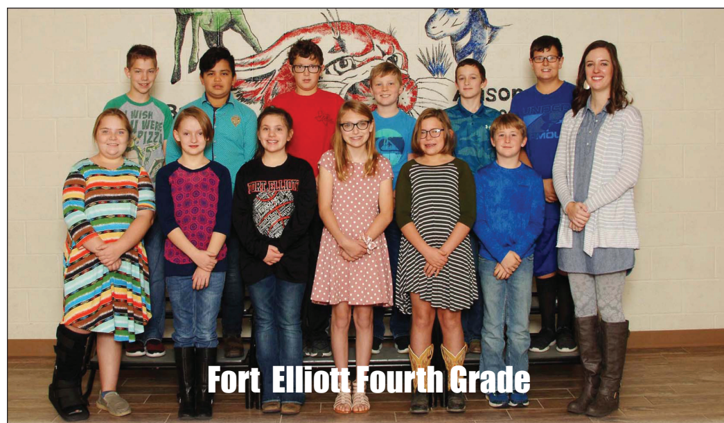
Fort Elliott Fourth Grade