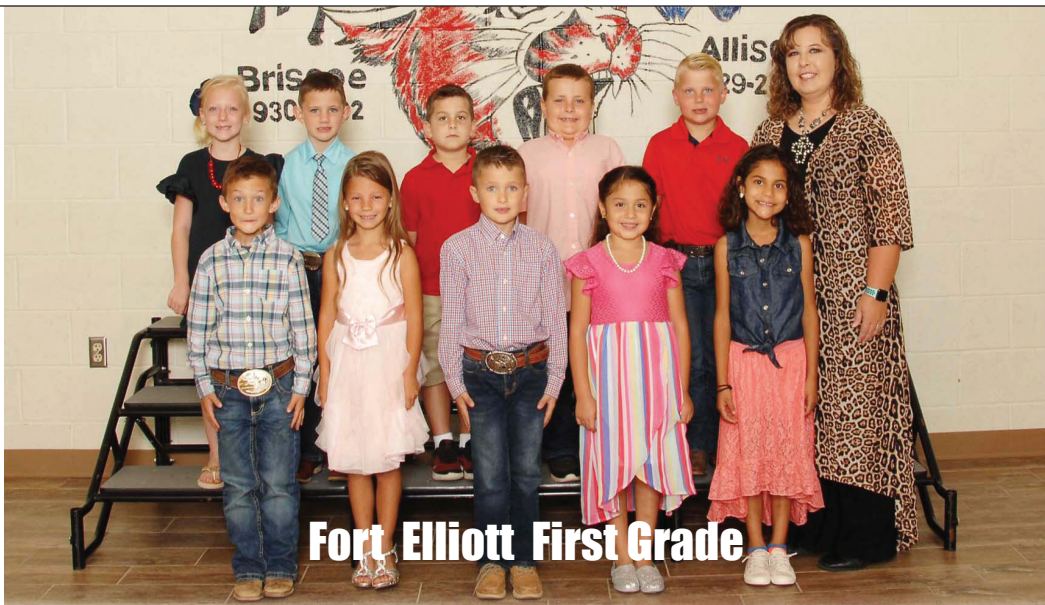
Fort Elliott First Grade