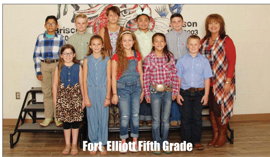
Fort Elliott Fifth Grade