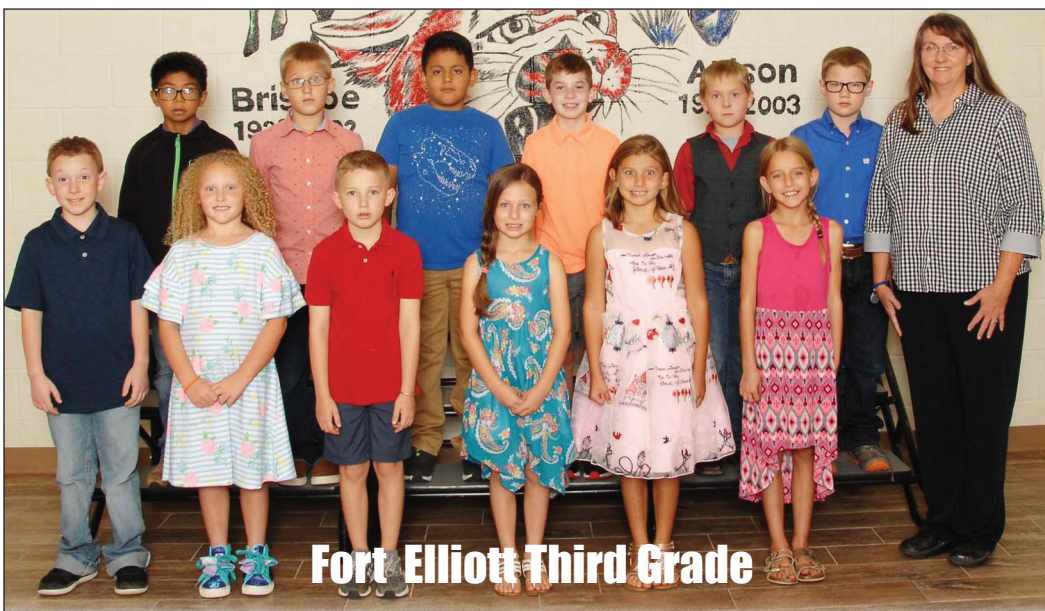
Fort Elliott Third Grade