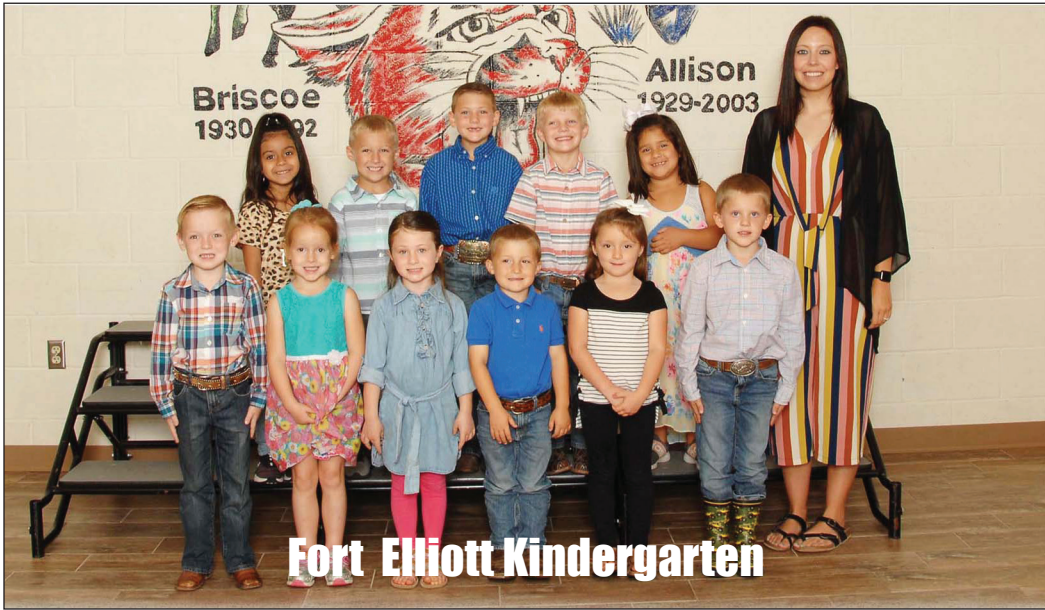
Fort Elliott Kindergarten

BOB'S BAIL BONDS 806-826-0654 Cell 806-334-0452 P.O. Box 264 Wheeler, TX 79096 Pat Childress