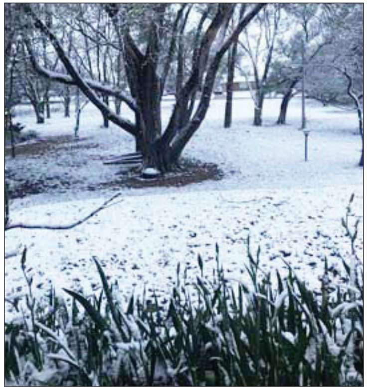
VIEW OUT MY KITCHEN WINDOW: 7:15 A.M. Tuesday, April 14, 2020 at 29°. Just a powdering of snow.