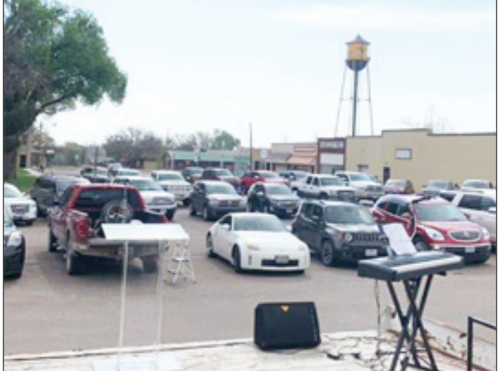
EASTER SERVICE: Cars were lined up on the square Sunday morning for the Cornerstone's Easter Service on the Square.

"He is risen." was portrayed Easter Sunday morning at Cornerstone's "Church on the Square". The scene was located on the roof of the churches Youth Activity Building at the northwest corner of Main and Texas streets.