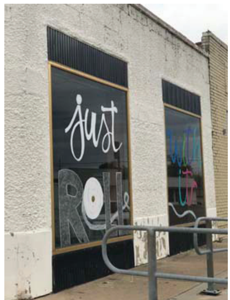
These two windows at the bank were a message to the Senior Class of 2020, but we all will have to "just roll with it."