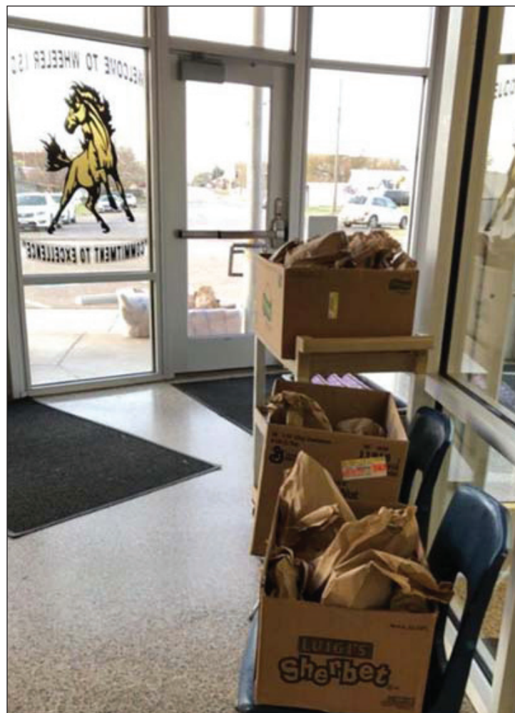
School lunches ready to be picked up.

Britt made a motion, seconded by Amy, to approve payment of all monthly bills (Continued Page 2)