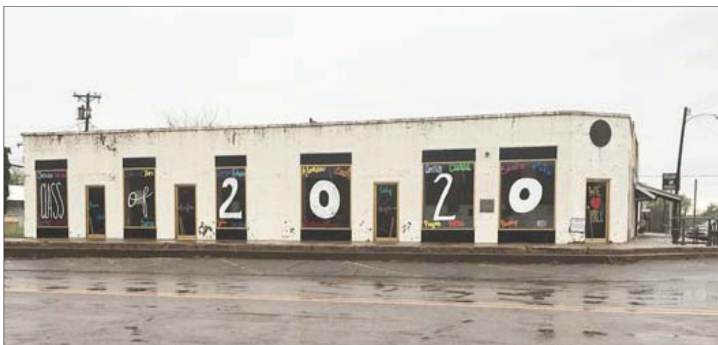
The Posse's work is complete.