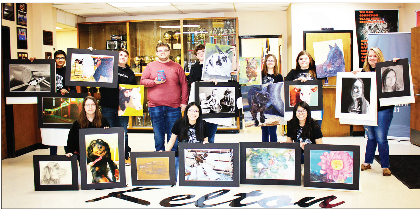
Kelton Art Students show work at VASE competition.