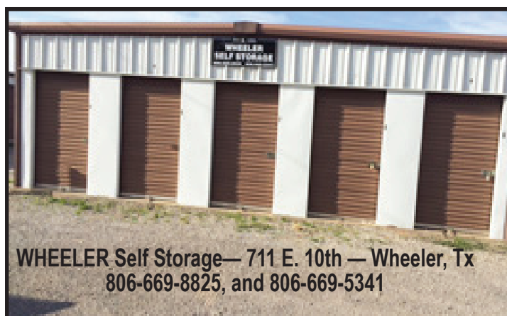
WHEELER Self Storage— 711 E. 10th — Wheeler, Tx 806-669-8825, and 806-669-5341