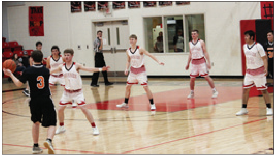
The Fort Elliott Cougar Seniors dominated the court against Higgins.