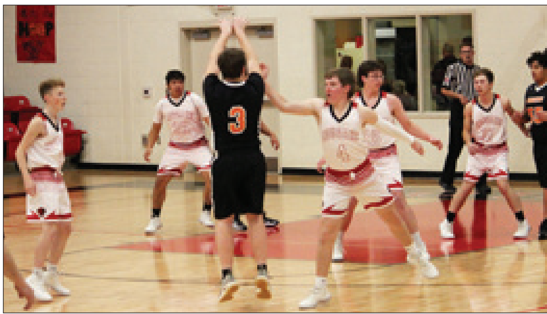
The Cougars played a tough defense in their winning game against Higgins.