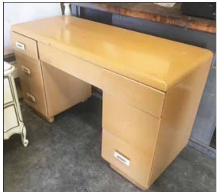
MAKE AND OFFER: 40's Blonde Bedroom Suite—Double Bedstead, 4-Drawer Dresser; Dressing Table w/large round mirror and bench, and Night Stand. 405-200-9705.