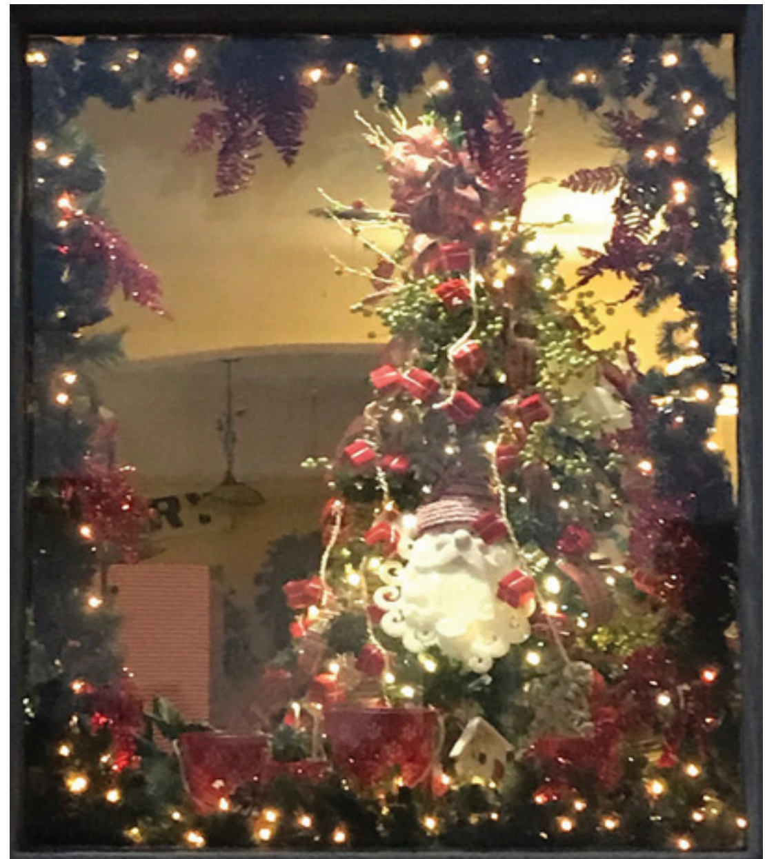
“It’s beginning to look a lot like Christmas”: Texas Street Floral is all decked out.

On Sunday we drove to Clinton, Ok. I went by the old ballet studio. It is a book store (Continued Page 5)