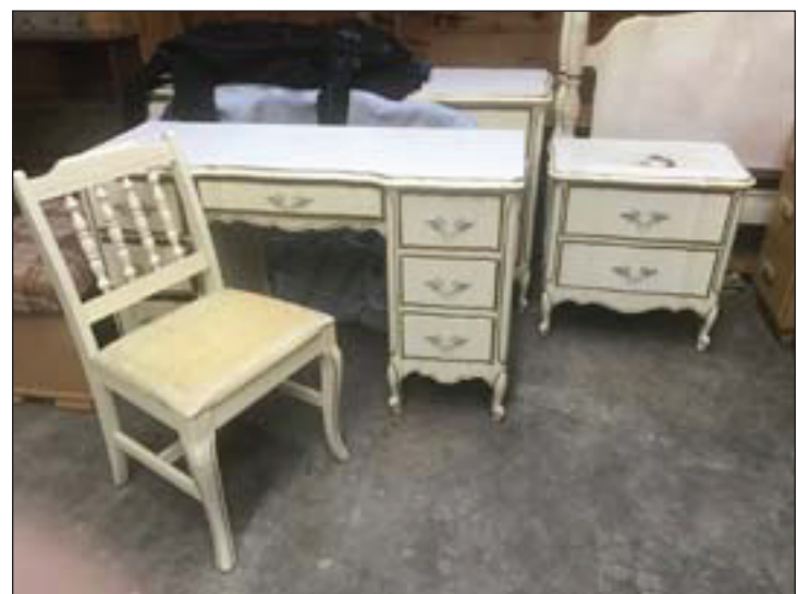
MAKE AND OFFER: 70's French Provincial Bedroom Suite—Double 4-Poster Bed, Night Stand, 9-Drawer Dresser w/large mirror; Desk and Matching Chair. 405-200-9705