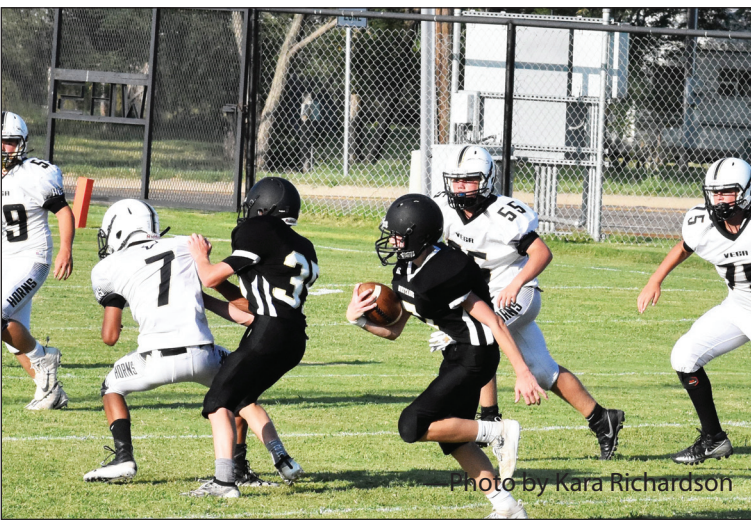
JV fell short to Vega 6-8.