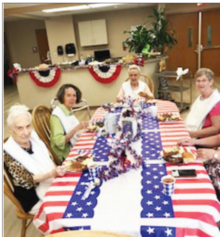
Parkview Assisted Living enjoying their T-Bone Steaks on the grill to celebrate Labor Day! "We Love Our Residents."