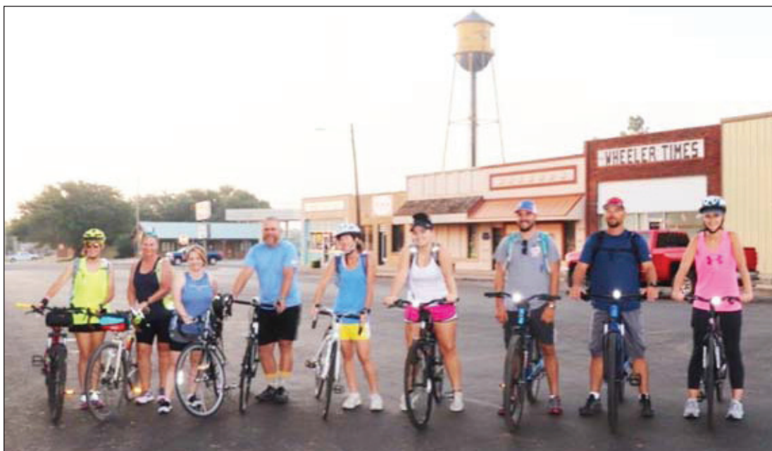
Bikers ready for their ride to Shamrock.