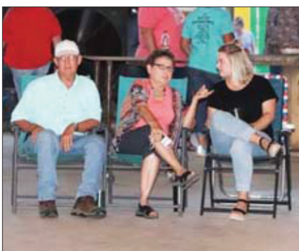
Enjoying the activities and visiting.