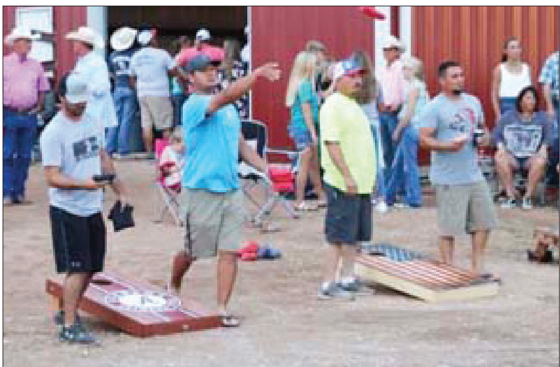
The ever popular Corn Hole Toss.