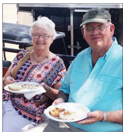
Having a burger.