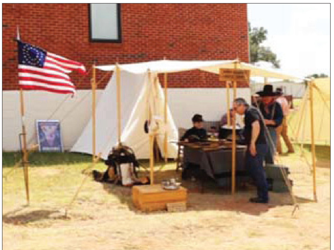
Reenactors set up camp at the Wheeler Historical Museum Saturday.