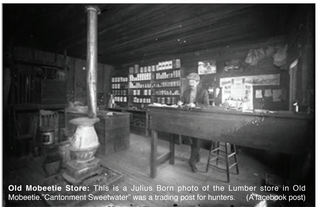
Old Mobeetie Store: This is a Julius Born photo of the Lumber store in Old Mobeetie. "Cantonment Sweetwater" was a trading post for hunters. (A facebook post)

KPDR-FM, 90.3 WHEELER, TEXAS Weekdays: 6:00 a.m. to 7:00 a.m.