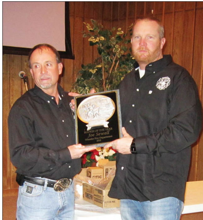
JOE SEWELL "Rookie Of The Year"