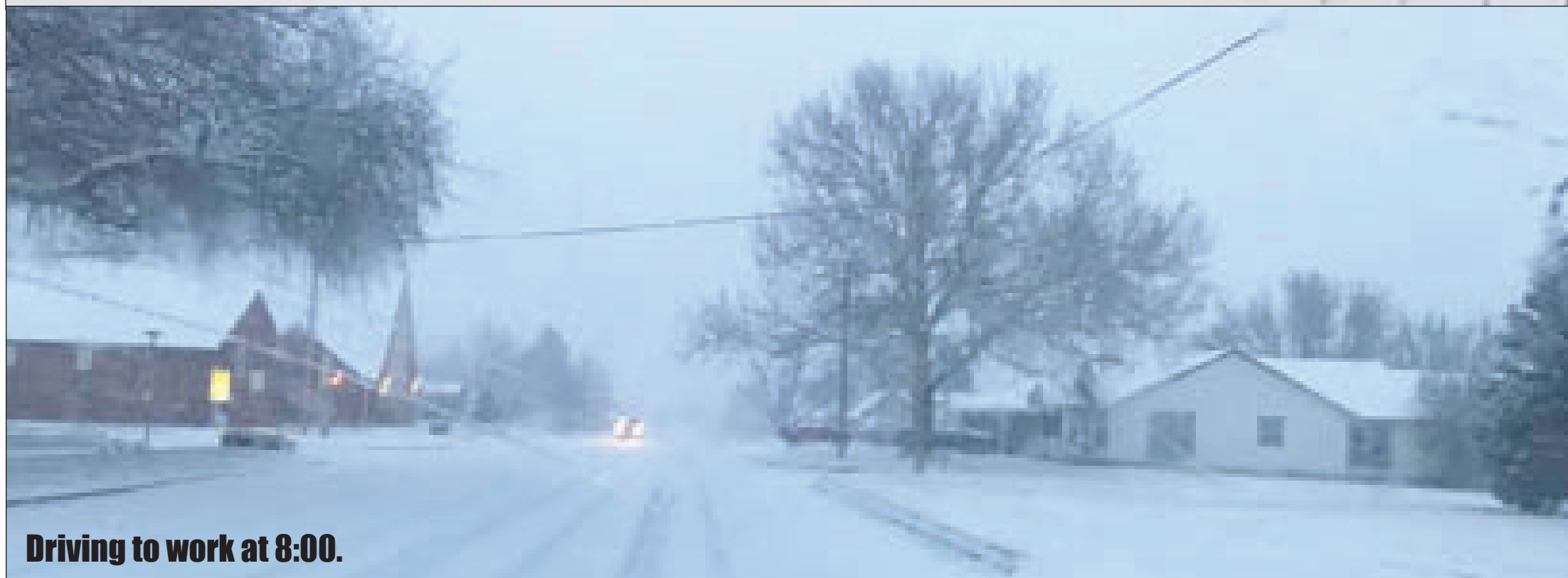
Driving to work at 8:00.