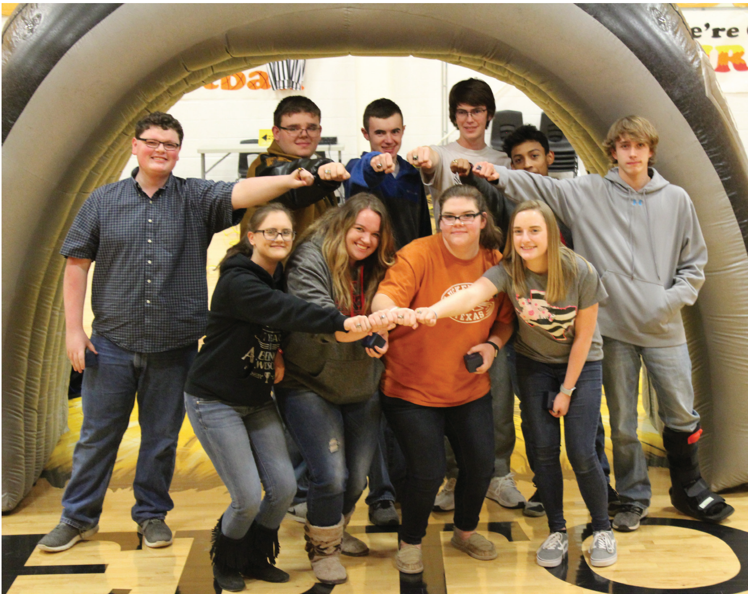
Kelton Junior Class Ring Ceremony, Class of 2020