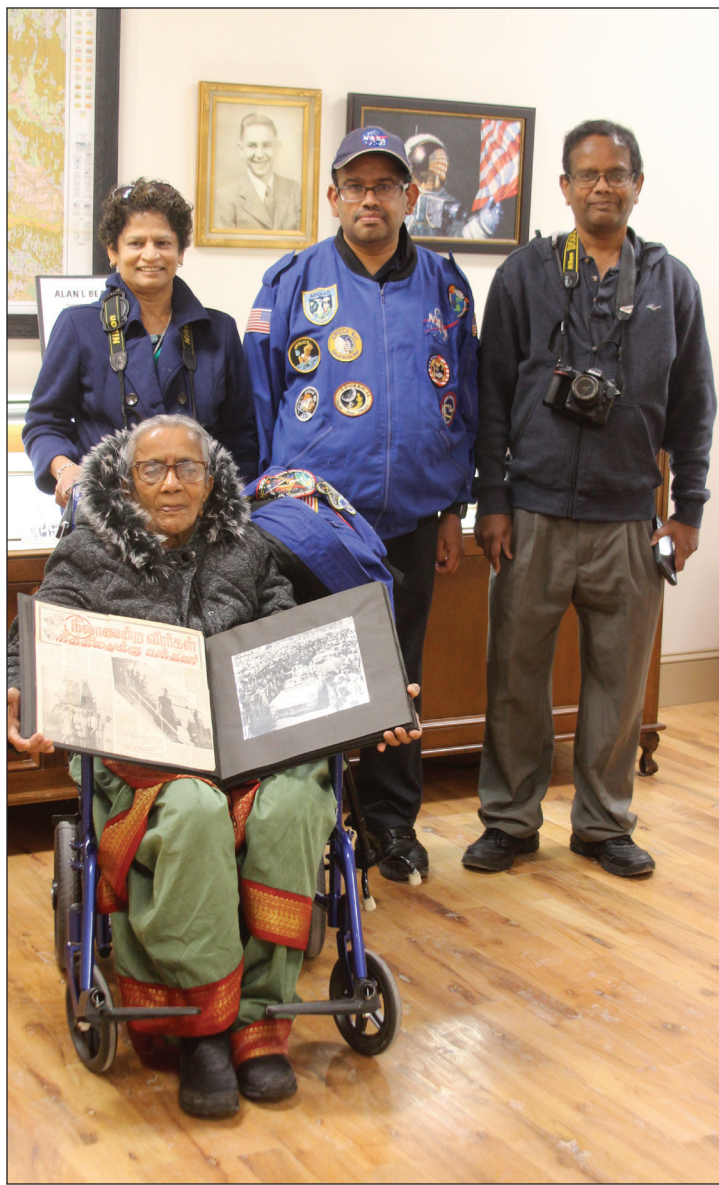
Wheeler Historical Museum visitors.