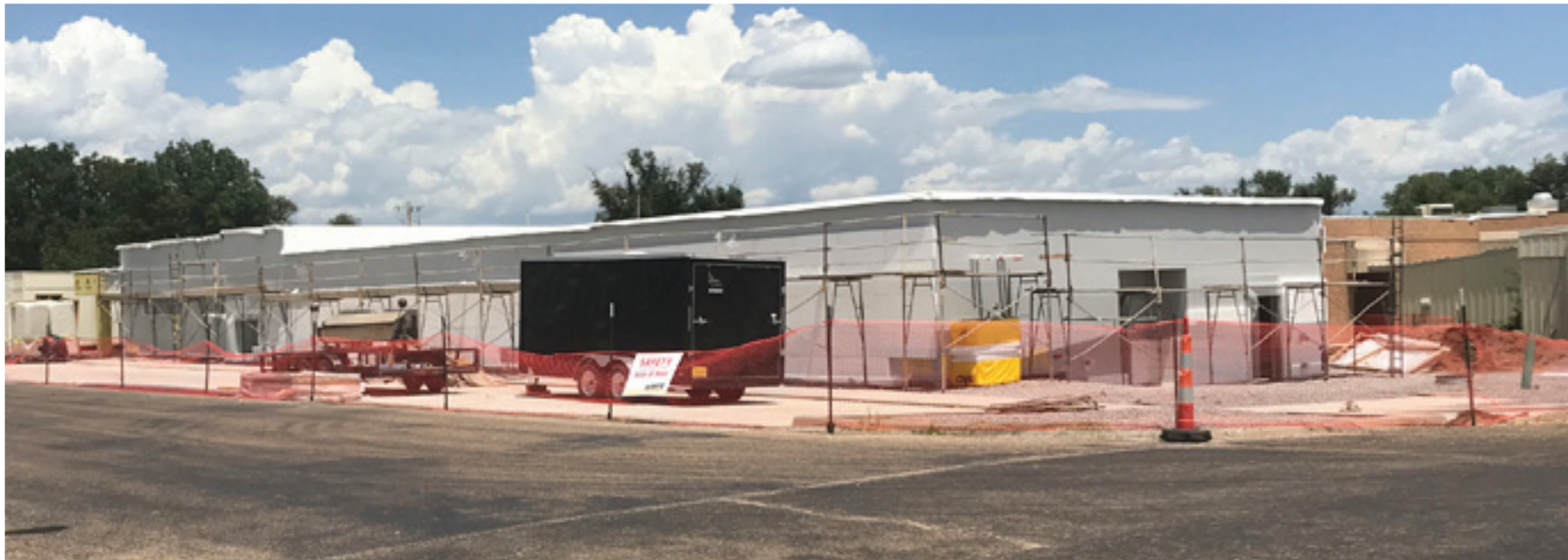
Parkview Construction — View from Tenth Street

Girl Scout registration Girl Scout building (behind public library) August 5th pool party at Wheeler pool from 6-8. Joyce Walker 806-669-4695