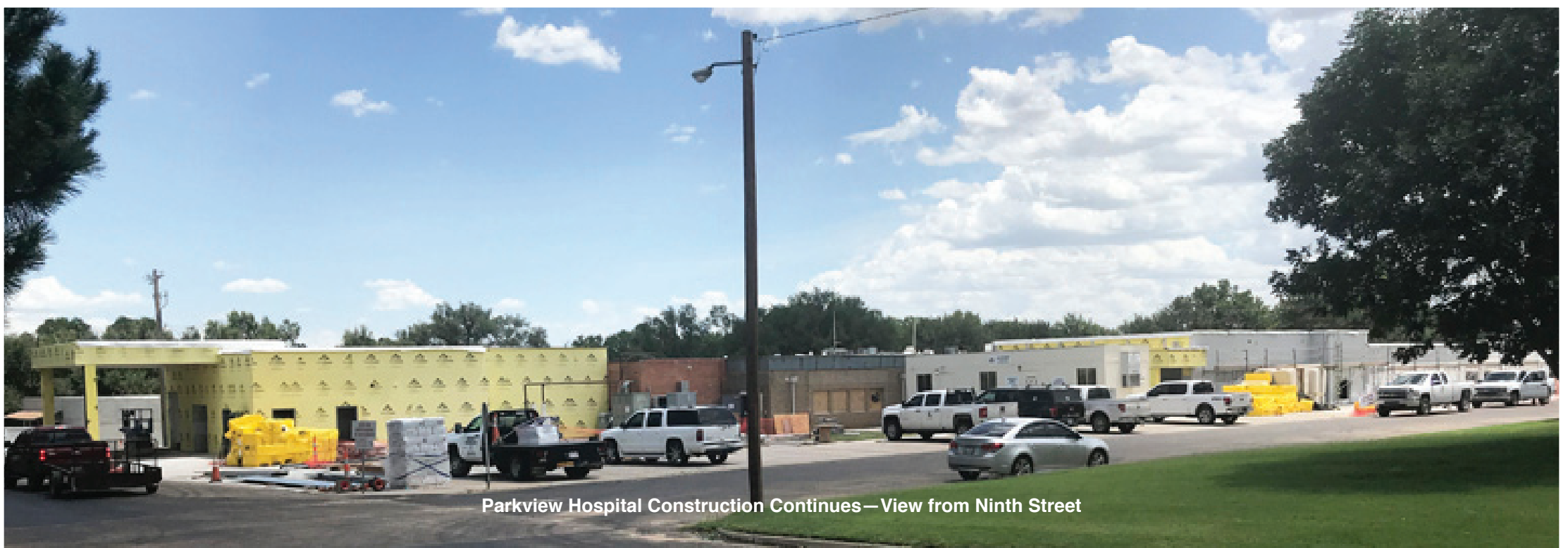
Parkview Hospital Construction Continues—View from Ninth Street