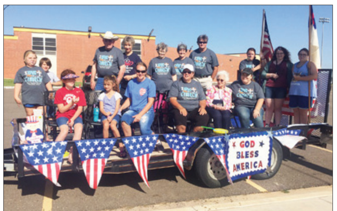
Church — First Baptist Church of Mobeetie