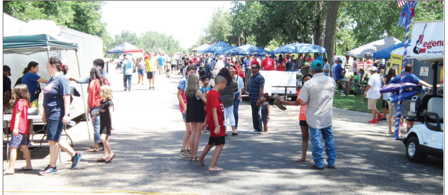
Where or what shall I eat?