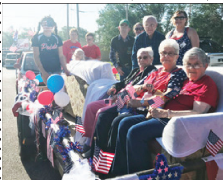
Business — Wheeler Care Center