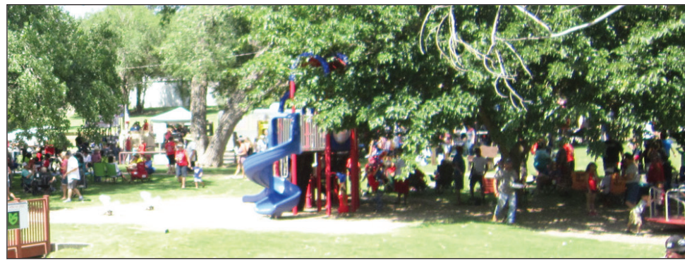
Mr. & Miss Firecracker Contestants