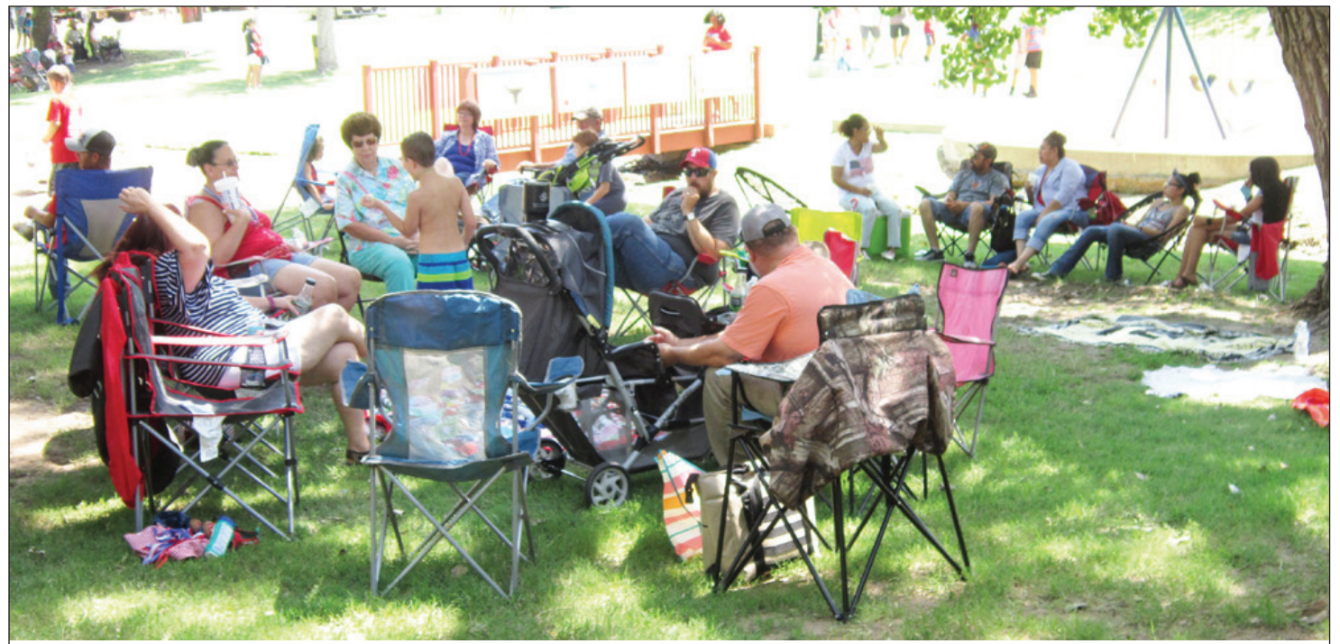
Shade was very popular at the park Wednesday.