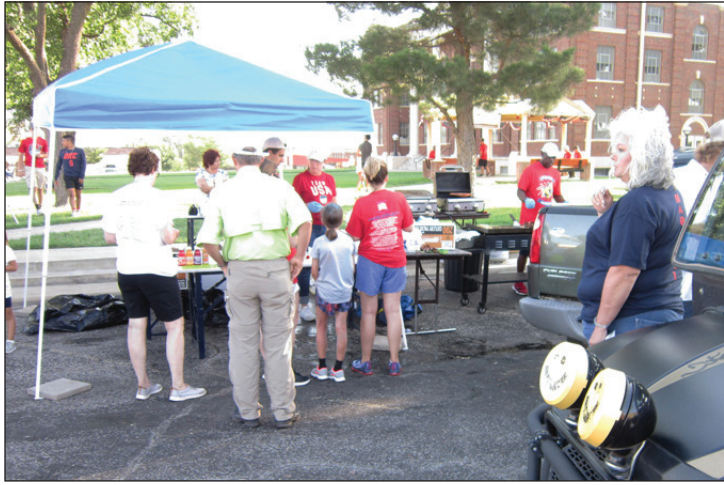
A popular spot Wednesday morning was Leon's breakfast tent.