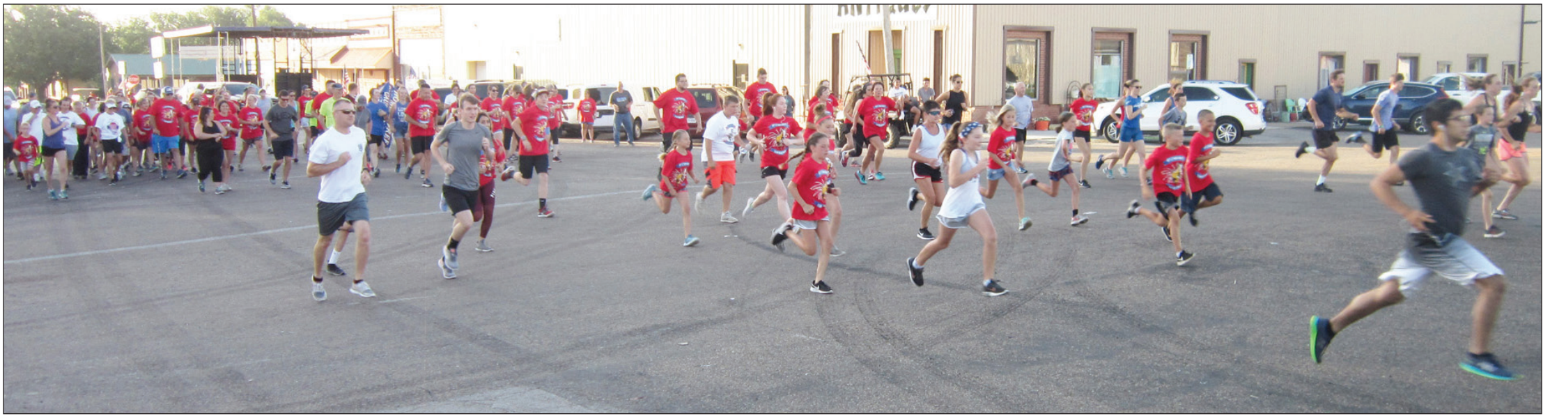
And the 2018 Fun Run/Walk Begins