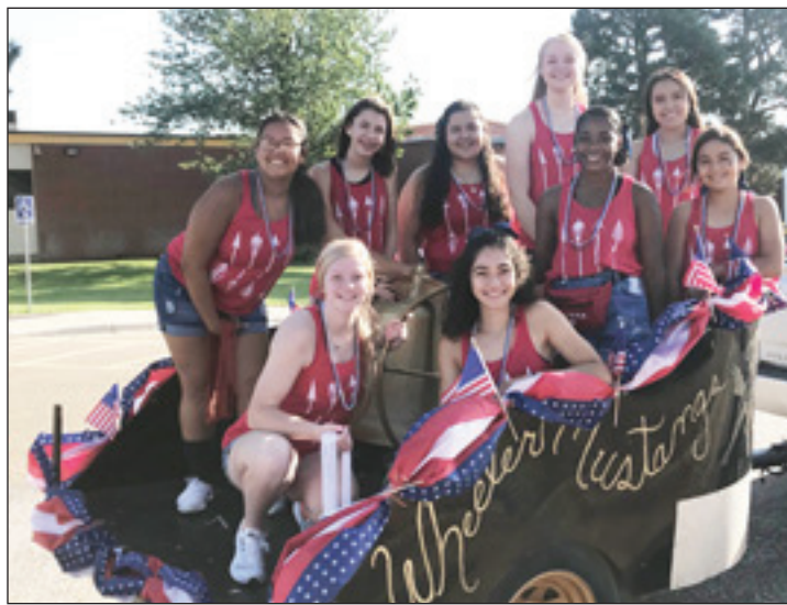
Wheeler I.S.D. Cheerleaders — Club or Organization