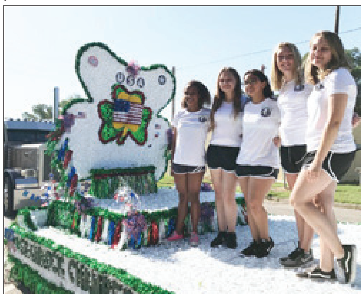
Open — Shamrock C of C, Shamrock Cheerleaders