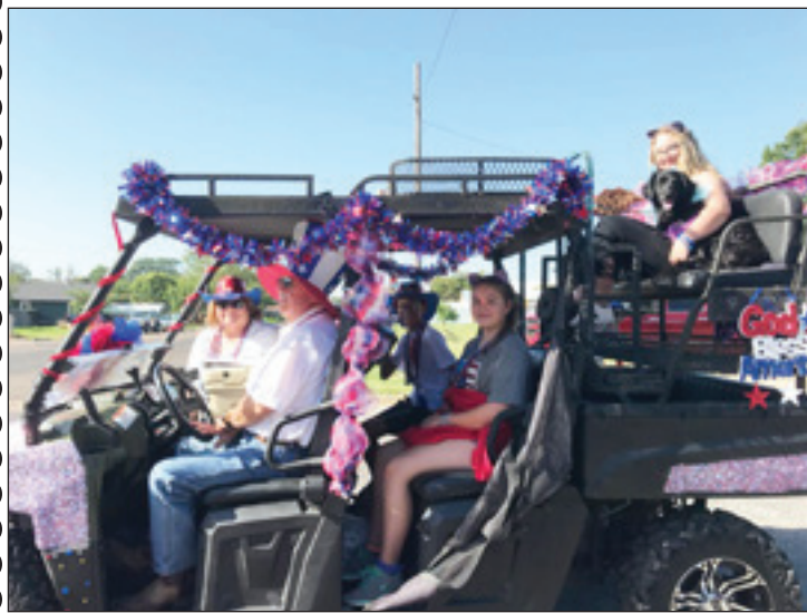
Puryear Ranch — ATV

Pampa MLS www.panhandleplainsrealty.com Amarillo MLS