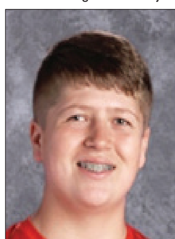
District Honorable Mention